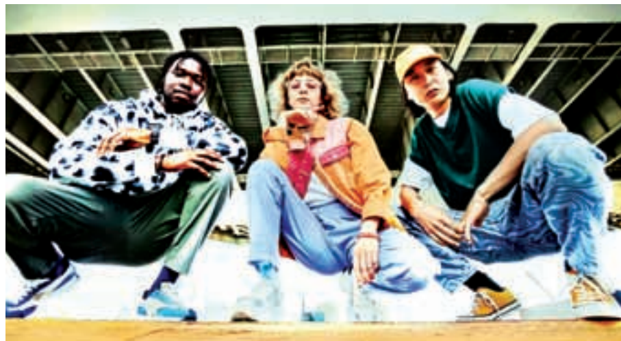
From funky to casual, streetwear is versatile.

Streetwear has transitioned from urban subculture to global fashion icon, and mastering this style is all about the right essentials. To truly elevate your streetwear game, here are the must-have items that will make your look stand out with effortless cool. First, the oversized hoodie is a cornerstone of streetwear. This versatile piece combines comfort with bold fashion. Opt for hoodies featuring striking graphics or vibrant colors to make a statement. The key is to let it drape loosely, creating a relaxed, yet intentional