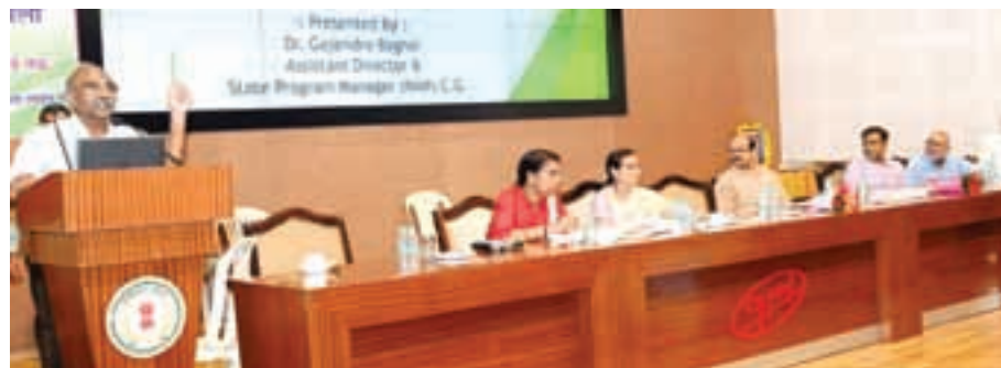
Training given to doctors to develop Ayush Grams.