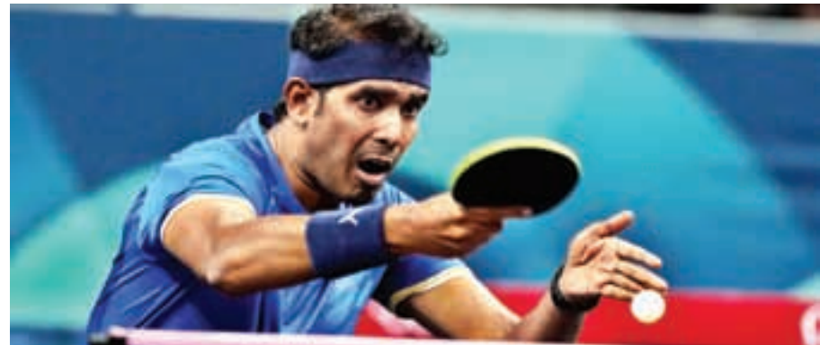
Sharath Kamal Achanta plays against China's Fan Zhendong during a men's teams round of 16 table tennis match.