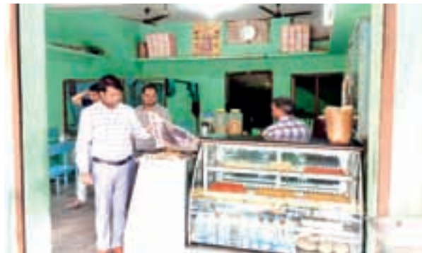
02 Food Safety Officer inspecting the hotel.

In this series, milk samples were taken by inspecting Devangan Milk Collection Center, Krishna Dairy Geedha Milk Collection Center of Mungeli. Samples of nutraceutical Nestogen, Protichem from Shivaay Medical, Bhumit Medical, pan masala from grocery store and paan cart, biscuits, flour from Suruchi Bhojanalaya, toast from ASP Food Products were collected for testing. Which has been sent to the State Food Testing Laboratory