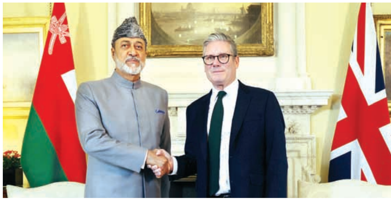
British Prime Minister Keir Starmer (R) shakes hands with the Sultan of Oman Haitham bin Tariq (L) ahead of talks at Downing Street in London, Britain.