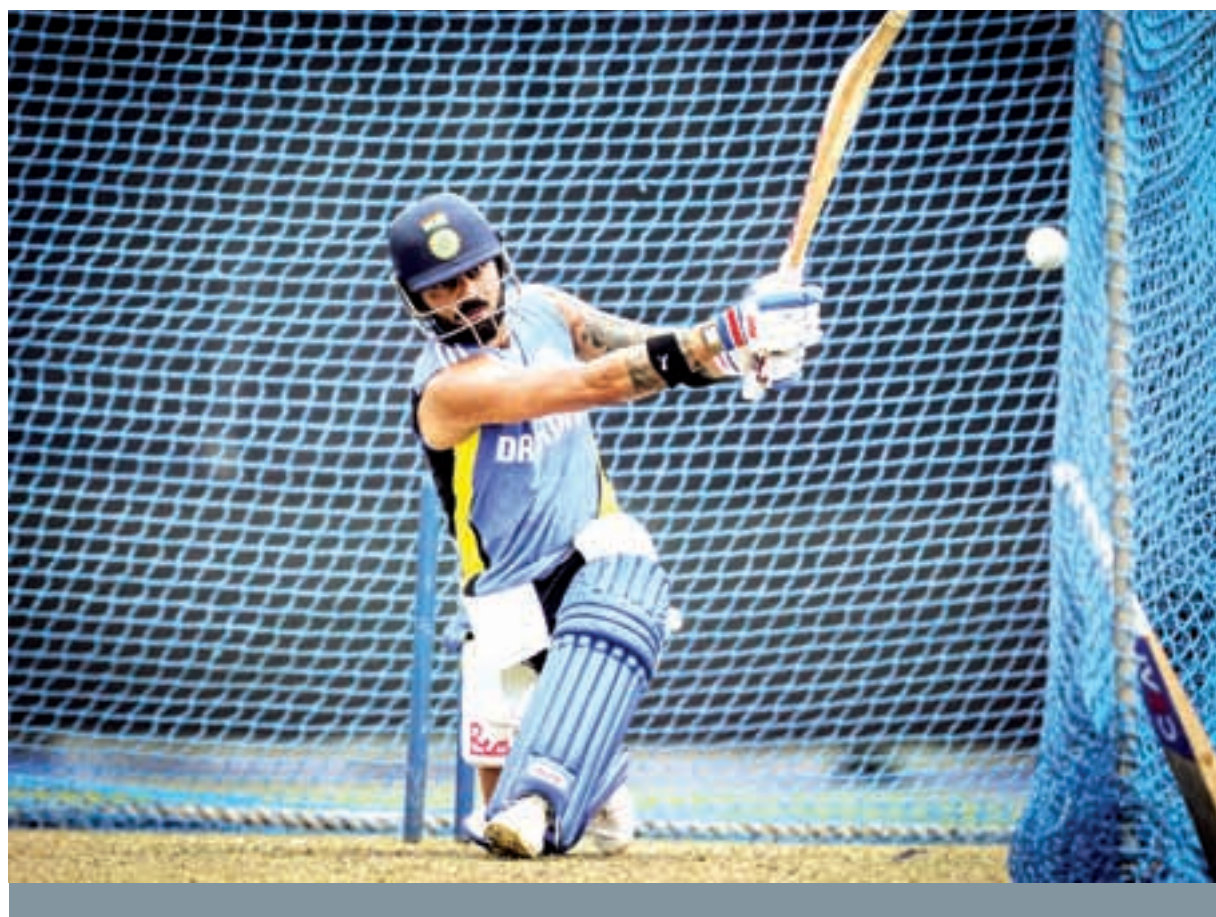
Virat Kohli during a practice session at the R. Premadasa International Cricket Stadium.

Curiously, none reflected that brittleness more than star batter Kohli. He has made 38 runs in two matches, but more than the volume of runs, the manner of his dismissals evoked greater