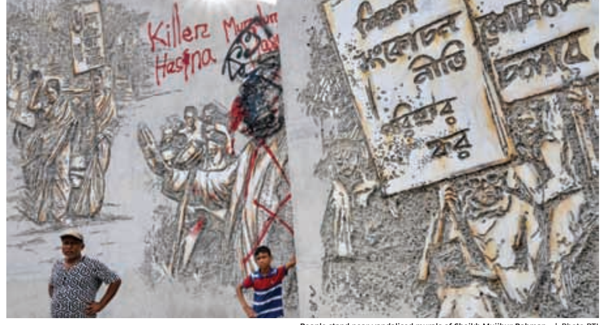
People stand near vandalised murals of Sheikh Mujibur Rahman.

DHAKA: Bangladesh President Mohammed Shahabuddin dissolved Parliament on Tuesday paving the way for fresh elections and an interim government was taking shape, a day after Prime Minister Sheikh Hasina abruptly resigned and fled the country following weeks of violent anti-government protests. As the army took charge on Monday and the death toll in the violence in which temples were also attacked rose to 440, the Anti-Discrimination Student Movement that spearheaded the massive protests said 84-year-old Nobel laureate Mohammad Yunus has agreed to head the interim government. Hasina, 76, is currently in India. A number of Hindu temples, households and businesses were vanda-