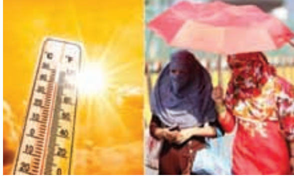
India recorded 41,789 suspected heat stroke cases.

NEW DELHI: More than 84 per cent of the districts in India are prone to extreme heat waves and 70 per cent are experiencing a rise in the frequency and intensity of extreme rainfall events, according to a new analysis. The report, "Managing Monsoons in a Warming Climate" by the independent development organisation IPE Global Limited and Esri India Technologies, said the country was experiencing extended summer-like conditions during the June-September monsoon.