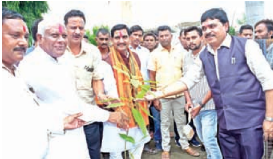
Union Minister of State for Housing and Urban Affairs Tokhan Sahu attended the program as the chief guest.

MUNGELI: Chhattisgarh's traditional festival Hareli festival was celebrated with enthusiasm in the district today. On this occasion, a program was organized in Gram Panchayat Sodhar. Union Minister of State for Housing and Urban Affairs Tokhan Sahu attended the program as the chief guest. He worshipped the agricultural equipment with rituals and wished for the happiness, prosperity and well-being of the people of the entire state. Addressing the program, Union Minister of State Mr. Sahu said that Hareli festival has special significance in our tradition and culture. Hareli is also the first festival of Chhattisgarh. This festival is traditionally celebrated with enthusiasm in rural areas. On this day, farmers worship agricultural equipment used in farming, children and youth in the village enjoy Gidi. MLA Punnul Mohle said that on the day of Hareli festival, medicated flour londi is fed to protect the health of livestock. Neem leaves