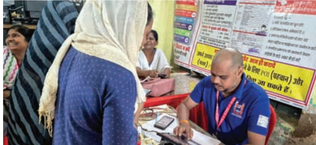
Mor Sangwari representative accepting documents from a beneficiary.

Mor Sangwari delivers certificates to the homes of 26278 beneficiaries.