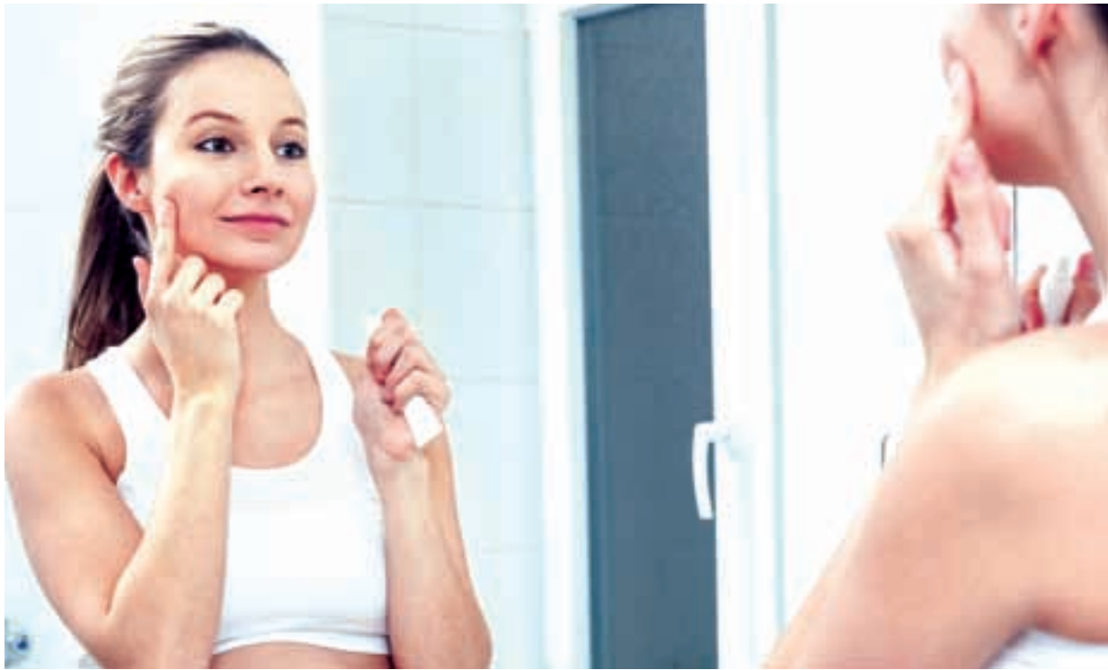
Stretch marks to acne, skin problems women face during pregnancy.