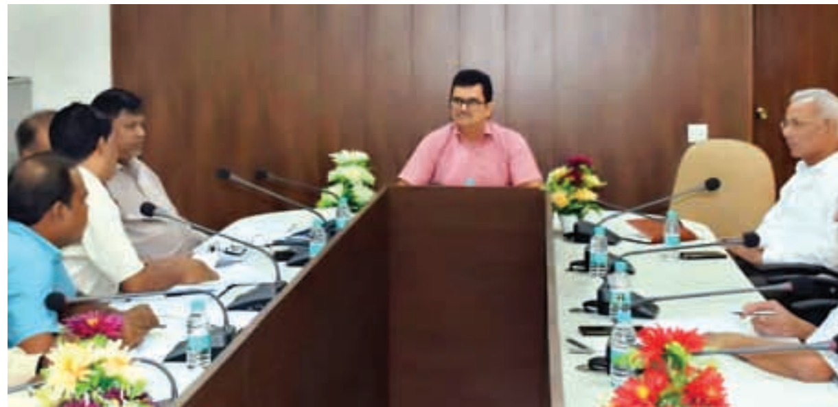
Chairman CSPCL conducted review of infrastructure development works of companies under CSPCL.