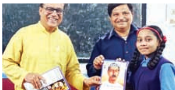
Important prog was organised on occasion of Munshi Premchand birth anniversary.