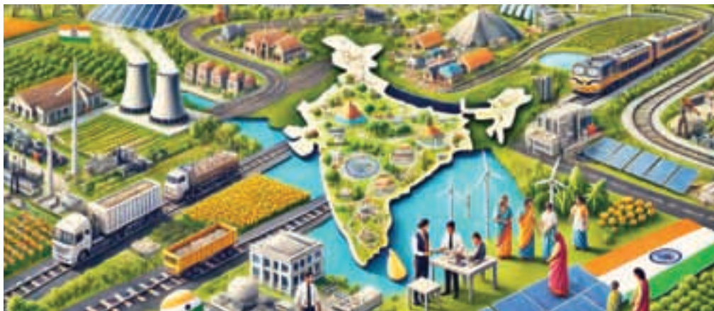
Image depicting India's economic growth and development sectors.