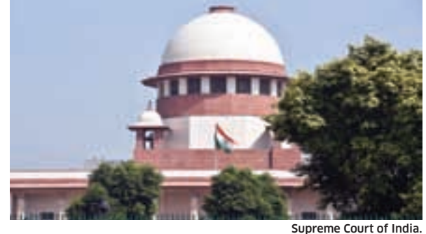
Supreme Court of India.

Press Trust Of India Asokan had said it was "unfortunate" that the Supreme Court criticised the association and also some of the practices of private doctors.