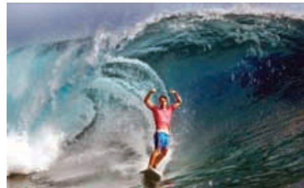
France's Kauli Vaast won the gold medal in the men's surfing event.