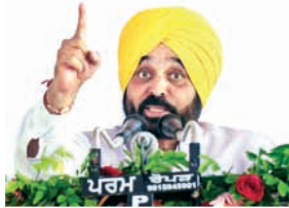
Punjab Chief Minister Bhagwant Mann

Addressing a gathering at State Van Mahotsav event here, Mann further said his government is collecting "new evidences" in the 2015 incidents pertaining to desecration of