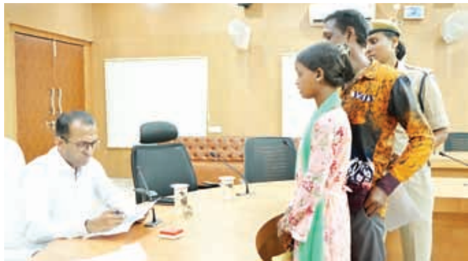
Collector gave patient hearing to grievances of general public in weekly Jandarshan prog.