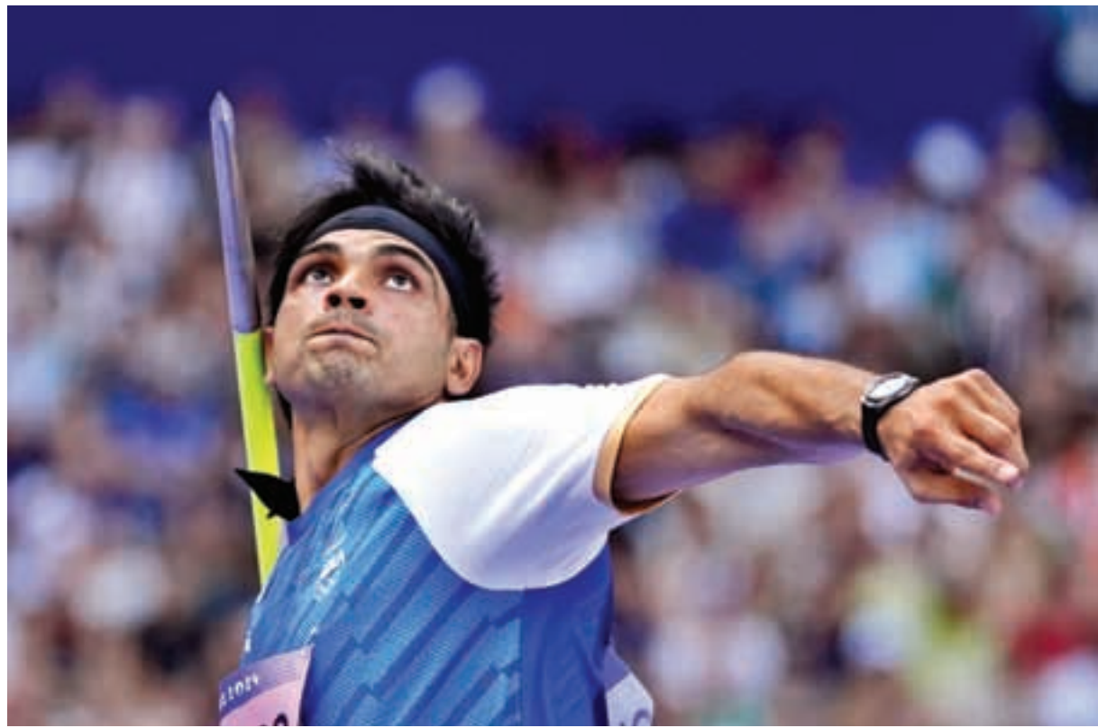
Neeraj Chopra competes during the men's javelin throw qualification at the 2024 Summer Olympics.

Tokyo Olympics silver medalist Jakub Vadlejch of Czech Republic, who was the only man to have beaten Chopra this year in Doha Diamond League, was seventh overall with a first round throw of 85.63m. All those who