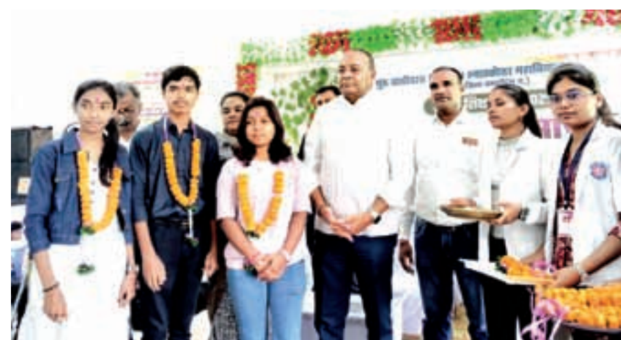
Diksharambh Samaroh 2024 of SGGGPC concluded here on Monday.