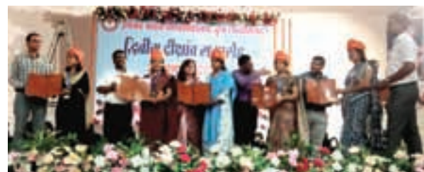
Students participating in rehearsal organised at BIT auditorium.