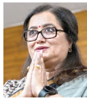
Mandya MP Sumalatha Ambareesh joins the BJP ahead of Lok Sabha elections, in Bengaluru, Friday.

"Listening to his (PM) speeches in the parliament, I have been inspired and I have understood things. Considering all these things, I felt joining BJP would be a right choice for me," she said, as she also thanked several state leaders including former Chief Ministers B S Yediyurappa, Basavaraj