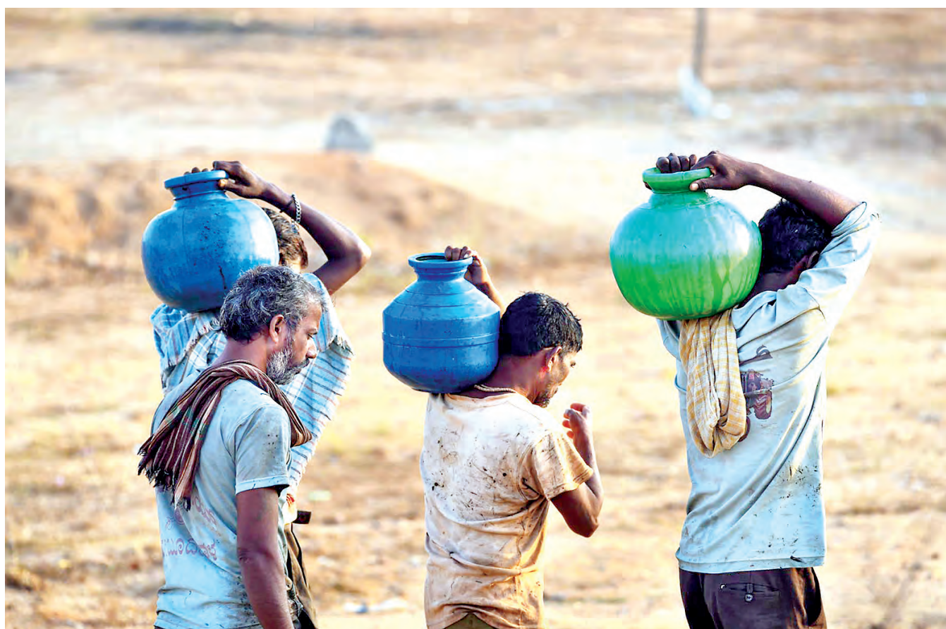
Residents carry pots after collecting drinking water amidst ongoing water crisis, in Chikkamagaluru, Friday, April 5.