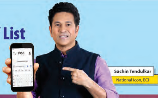
Sachin Tendulkar National Icon, ECI

Check your name in the Voters' List SMS <ECI> space <EPIC No.> to 1950 or visit elections24.eci.gov.in