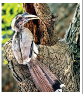
An Indian grey hornbill perches on a tree, in New Delhi, Friday.