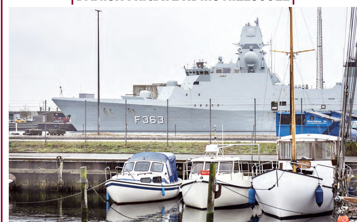
The Danish frigate HDMS Niels Juel, number F363, is docked in Korsoer, Denmark. Denmark's Armed Forces said a technical problem arose with a Harpoon missile on board the Danish frigate HDMS Niels Juel as it was taking part in a test while anchored in the Korsoer naval base.