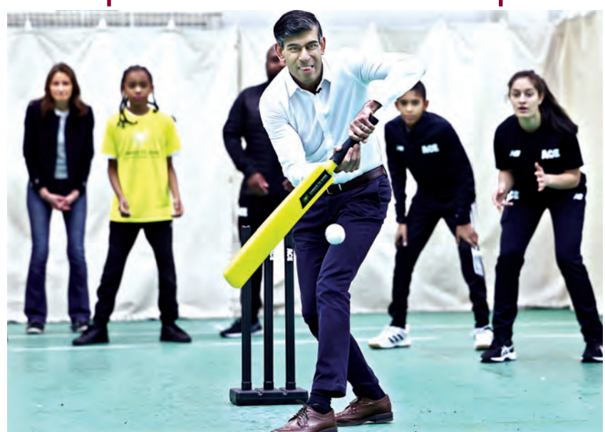
Britain's Prime Minister Rishi Sunak takes part in a cricket practice session whilst meeting participants in the ACE Programme, during a visit to the Oval cricket ground in south London, on Friday, April 5.