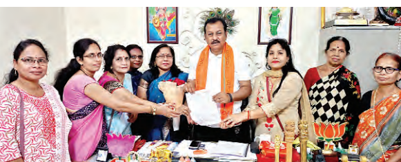
Bhilai, Apr 05: