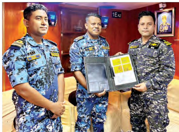
Personnel of India Coast Guard and Bangladesh Coast Guard during handing of Bangladeshi fishermen. Indian Coast Guard forces saved the lives of 27 Bangladeshi fishermen stranded in the middle of the sea and handed them over to Bangladesh on Friday.

The ICG ship launched a boarding team to investigate. During investigation it was found that the boat had a "steering gear breakdown for the last two days