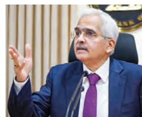
Reserve Bank of India (RBI) Governor Shaktikanta Das during a press conference after delivering the Monetary Policy Statement, at the RBI headquarters in Mumbai, Friday, April 5, 2024.

As per a recent news report, RBI bought 8.7 tonne of gold in January alone which is the highest in two years. The central bank's gold holdings had touched 812.3 tonne at the end of January from 803.58 tonne in the preceding month, as per the World Gold Council. The price of gold