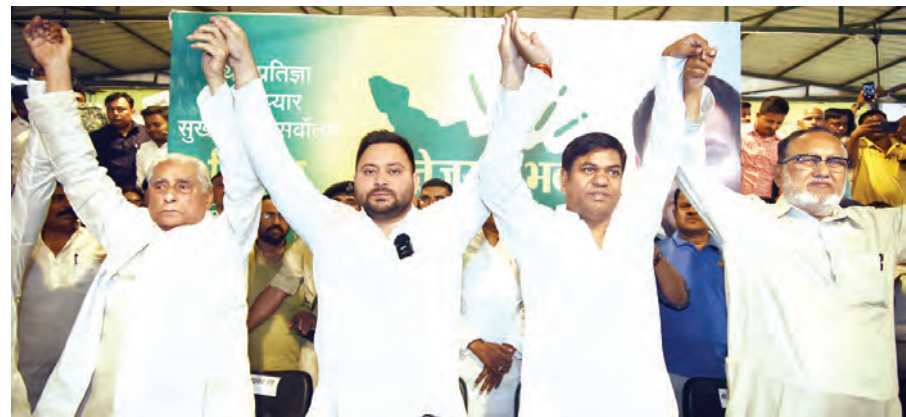
RJD leader Tejashwi Yadav with Vikasheel Insaan Party Chief Mukesh Sahani and other leaders during a press conference, in Patna, Friday.