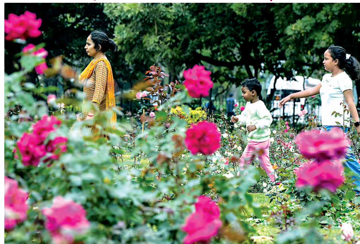
Visitors at the New Delhi Municipal Council's (NDMC) Rose Festival at the India-Africa Friendship Rose Garden on Shanti Path at Chanakyapuri, in New Delhi, Saturday.