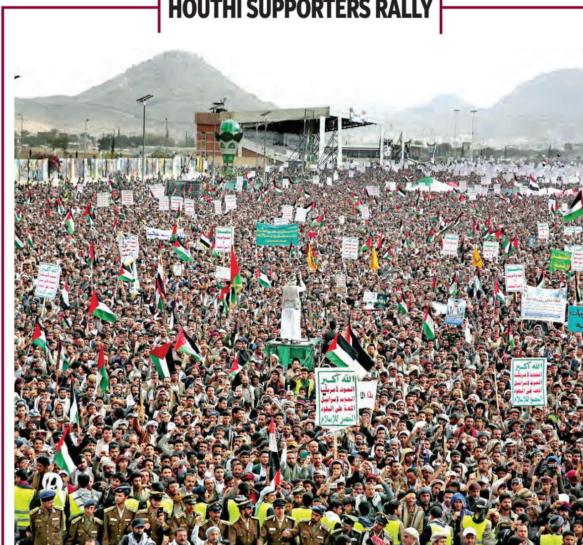
Houthi supporters attend a rally against the U.S.-led airstrikes on Yemen and the Israeli offensive in the Gaza Strip in Sanaa, Yemen.