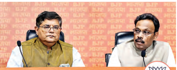
BJP National General Secretary Vinod Tawde (R) announces first list of candidates for the upcoming Lok Sabha elections during a press conference, in New Delhi, Saturday.