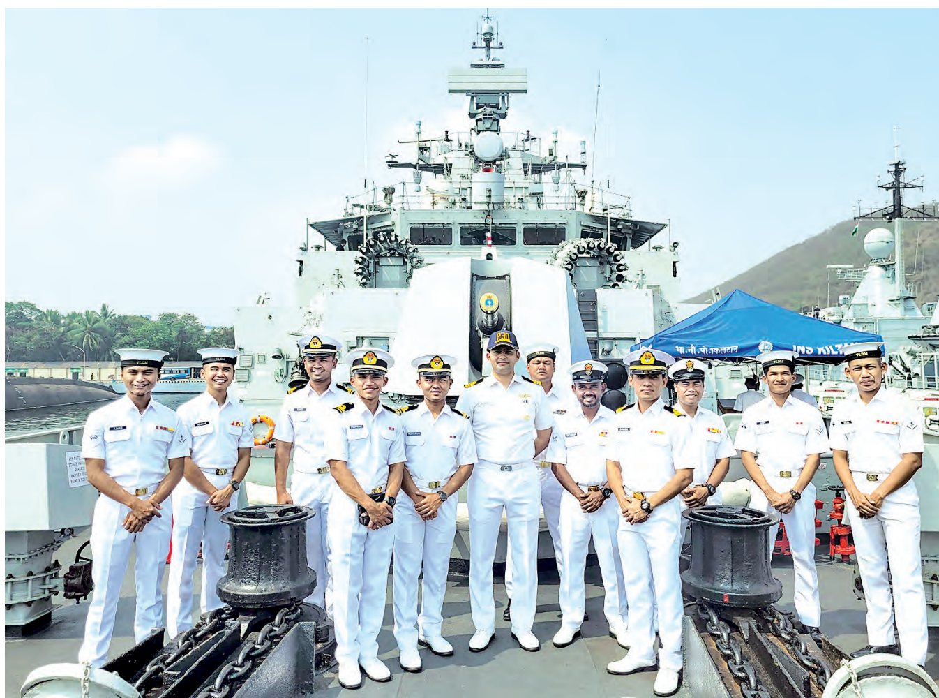
India-Malaysia bilateral maritime exercise 'Samudra Laksamana' underway, off the Visakhapatnam coast.