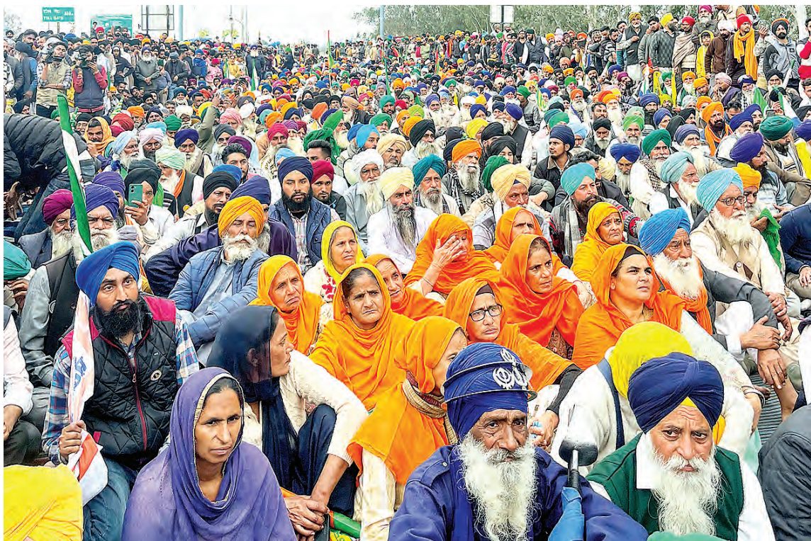
Farmers during their ongoing protest, at the Punjab-Haryana Shambhu border, in Patiala district, Saturday.