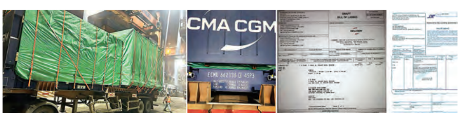
A combination of photos shows bills of landing and a container onboard a Karachi-bound ship from China.