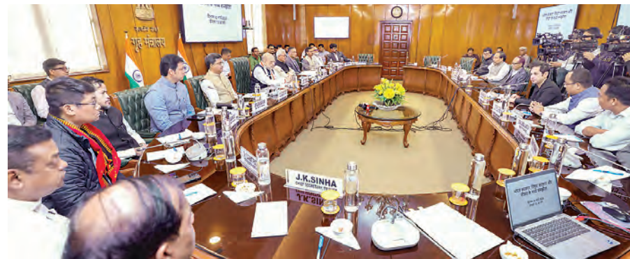
Union Home Minister Amit Shah with Tripura Chief Minister Manik Saha, TIPRA Motha supremo Pradyot Debarma and others during the signing of agreement between TIPRA Motha and the governments of Tripura and India, in New Delhi, Saturday.

"I assure all stakeholders of Tripura that you won't have to fight for your rights anymore. The government of India will be two steps ahead in creating mechanisms to safeguard your rights," he said at an event