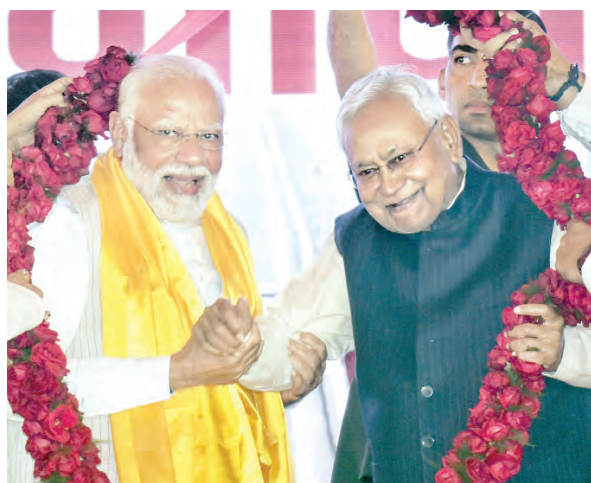
PM Modi and Bihar CM Nitish Kumar being garlanded during the inauguration and foundation stone laying ceremony of various development projects, in Aurangabad, Saturday.

"You (Modi) had come to Bihar earlier as well but I disappeared (from NDA) for some time. Now I am again with you and assure you that I will remain with the NDA forever," Kumar,