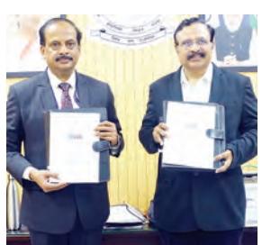
members and Scientists from the institutions.