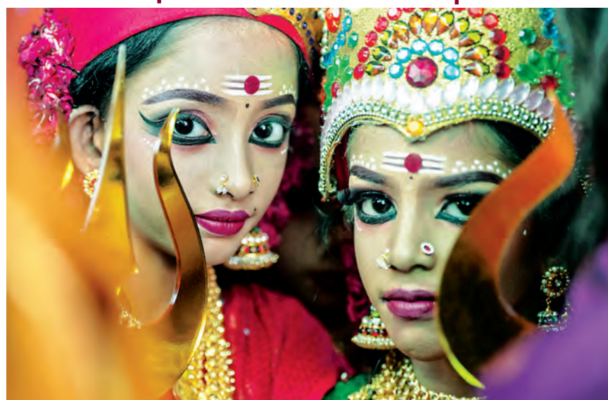
Children, dressed as the 'Devi' participate in the 'Chikkara Kottikkal' festival, at Kanichukulangara Devi temple near Kochi, Saturday.