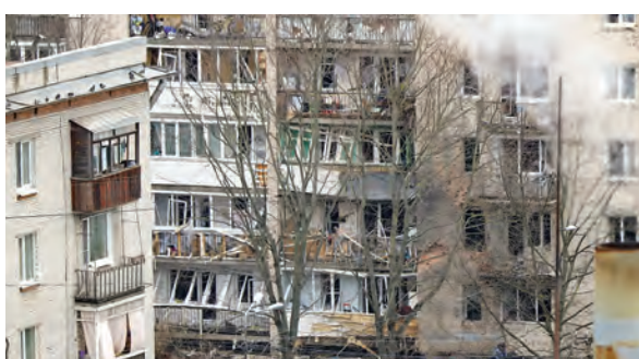
A view of a damaged apartment's building after a reported drone attack in St. Petersburg, Russia, Saturday, March 2.

The Mash news site said that the apartment build-