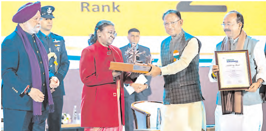
CM Vishnu Deo Sai with his deputy Arun Sao receiving the 'All India Clean City (with a population of less than one lakh) - Rank 2' award to Patan from the President Droupadi Murmu, in New Delhi, Thursday.

Chhattisgarh's Patan and Lonavala in Maharashtra got the second and third positions re-