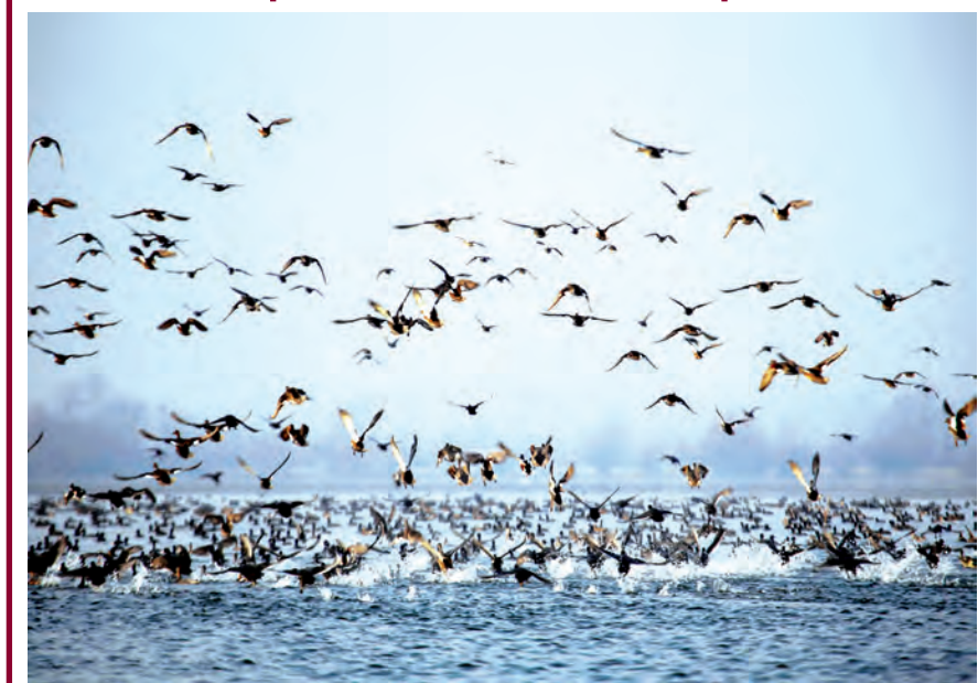
A flock of migratory birds flies over the Wullar Lake, in Bandipora district, Thursday.