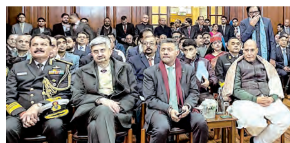
Defence Minister Rajnath Singh during an interaction with the Indian community, at India House in London.

Singh called on Prime Minister Sunak at 10 Downing Street here on Wednesday evening for discussions on a wide range of issues across bilateral defence and economic ties. He also gifted a Ram Darbar statue to Sunak, Britain's first Hindu Prime Minister, during the meeting also attended by UK National Security Adviser