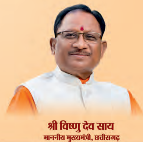
श्री विष्णु देव साय माननीय मुख्यमंत्री, छत्तीसगढ़

सबका साथ- सबका विकास, सबका विश्वास और सबका प्रयास