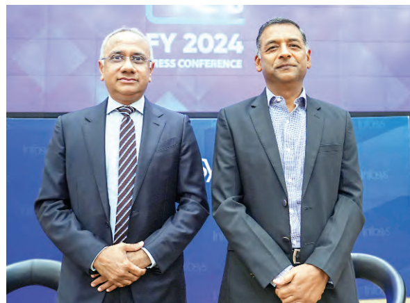
Infosys CEO Salil Parekh and CFO Nilanjan Roy during a press conference organised to announce the Q3 financial results of the company, in Bengaluru, Thursday, Jan 11.

IT company Infosys on Thursday posted a 7.3 per cent decline in consolidated net profit at Rs 6,106 crore in the third quarter of the current financial year. The company had posted a net profit (attributable to shareholders) of Rs 6,586 crore during the same period a year ago, Infosys said in a regulatory filing. Consolidated revenue from operations of the company increased marginally by 1.3 per cent to Rs 38,821 crore during the quarter under review from Rs 38,318 crore in the year-ago period. Infosys revised its revenue growth guidance for the ongoing financial year to 1.5-2 pc from 1-2.5 per cent estimated earlier. The company also said