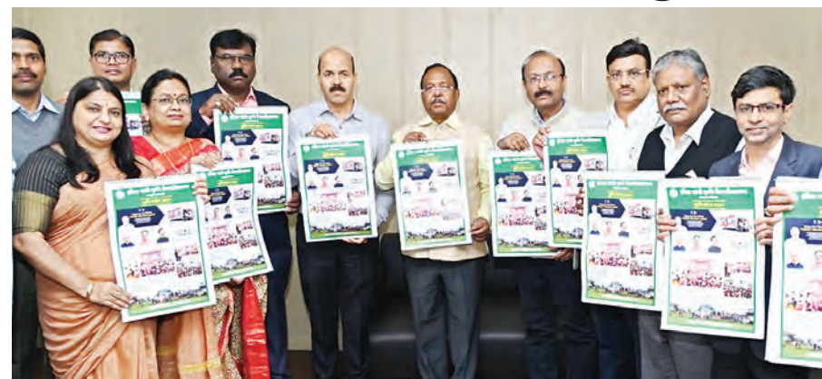
Raipur, Jan 11: