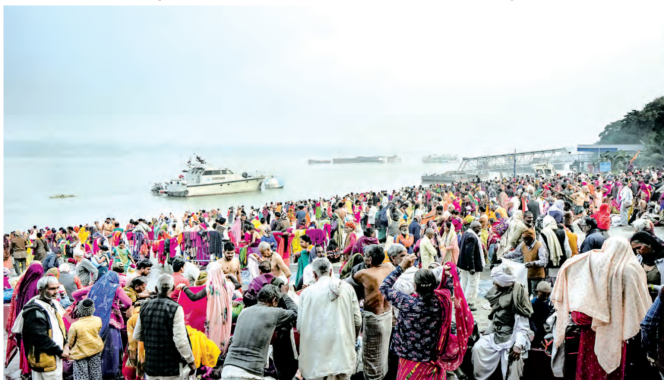
Gangasagar Mela pilgrims gather at the bank of Ganga river on their way to Sagar Island ahead of 'Makar Sankranti', near Babughat transit camp in Kolkata, Thursday, Jan. 11.