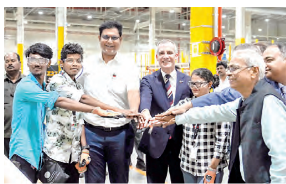
Tamil Nadu Minister for Industries T.R.B. Rajaa with United States Ambassador to India Eric Garcetti during the inauguration of a manufacturing unit of First Solar, at Pillaipakkam, Sriperumbudur in Kanchipuram district, Thursday, Jan. 11.

US-based First Solar said it has invested USD 700 million in setting up India's first integrated solar manufacturing plant in Tamil Nadu that was inaugurated on Thursday. The facility, which has an annual capacity of 3.3 gigawatts (GW), is located in Tamil Nadu. It will produce the company's series 7 Photovoltaic (PV) solar modules for the Indian market. The facility has provided a direct employment opportunity to around 1,000 people, according to a statement. Tamil Nadu's Minister for Industries, Promotions and Commerce TRB Rajaa was the chief guest at the plant's inaugural ceremony that was also attended