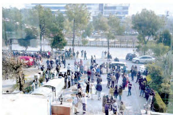
People stand outside their offices building after an earthquake was felt in Islamabad, Pakistan, Thursday, Jan. 11. A magnitude 6.4 earthquake rattled much of Pakistan and part of neighboring Afghanistan on Thursday, sending panicked residents fleeing from homes and offices and especially frightening people in remote villages across the country, Pakistani officials and the U.S. Geological Survey said.

Tremors were felt in Islamabad, Lahore, and its surrounding areas, and parts of Khyber Pakhtunkhwa province,