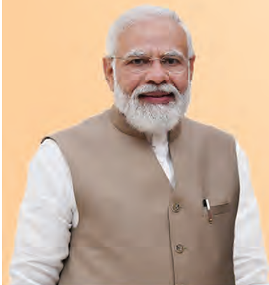
श्री नरेंद्र मोदी माननीय प्रधानमंत्री

प्रतियोगिता परीक्षाओं में पारदर्शिता की गारंटी प्रतियोगिता परीक्षाओं में पारदर्शिता की गारंटी, छत्तीसगढ़ लोक सेवा आयोग की परीक्षा में अनियमितता की शिकायतों की सीबीआई जांच का निर्णय