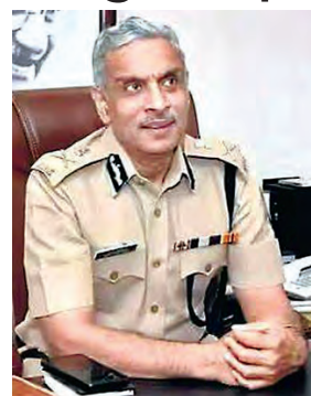
DG (Prisons) Sanjay Baniwal

Delhi has three prison complexes -- Tihar, Mandoli and Rohini, where 19,967 inmates are lodged at present. This is almost double the capacity of 10,026 inmates. There are 16 separate jails, including two for women inmates, in these three prison complexes. Baniwal said every system is strained due to overcrowding, resulting in