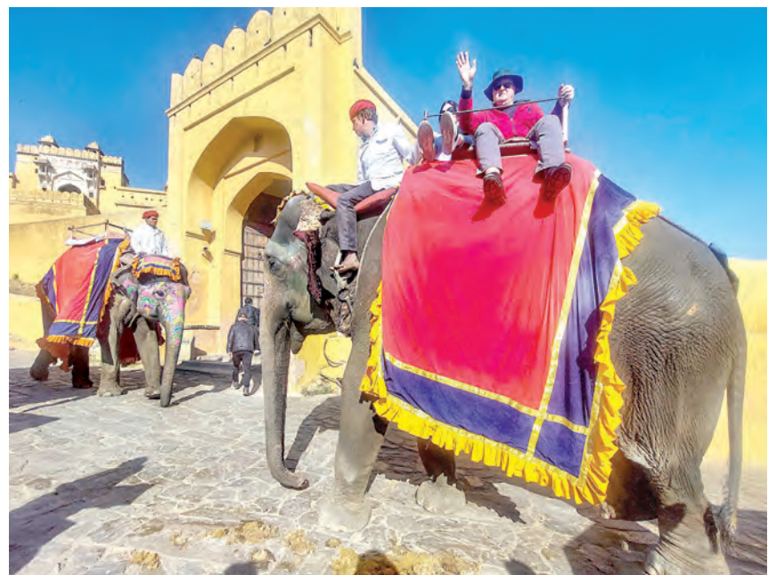
Tourists take elephant ride at Amer Fort, in Jaipur, Thursday.