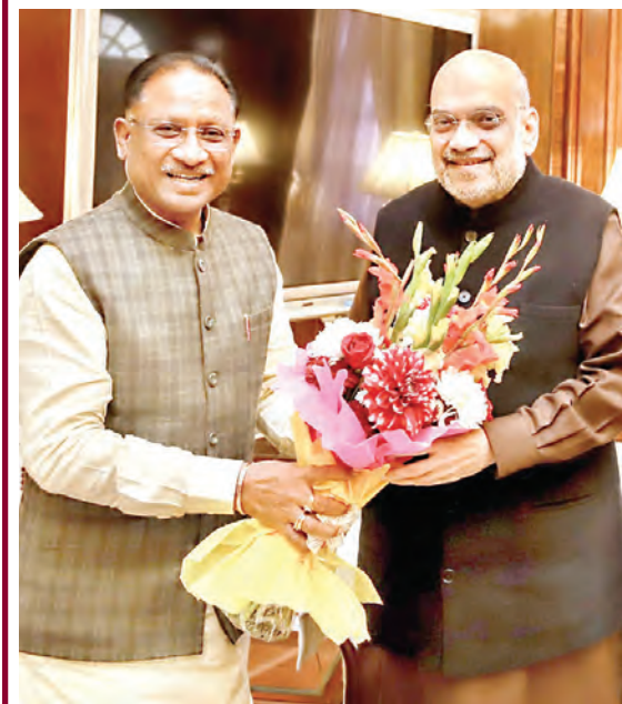
Chief Minister Vishnu Deo Sai paid courtesy visit to Union Home Minister Amit Shah at his official residence in Delhi on Thursday.