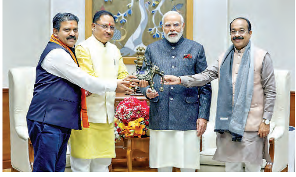
PM Modi with CM Vishnu Deo Sai and his deputies Arun Sao and Vijay Sharma during a meeting, in New Delhi, Saturday.

Deputy chief ministers Arun Sao and Vijay Sharma accompanied Sai in the meeting with Modi at