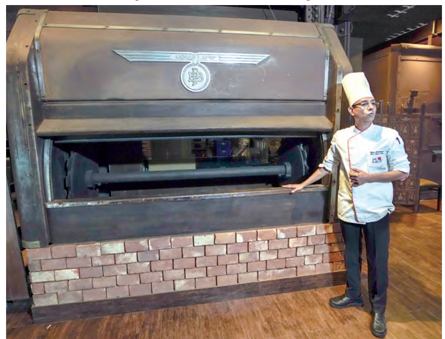
A chef shows a vintage oven at The Bakery, established in 1830, of the Lalit Great Eastern hotel which was used to prepare cakes during the British era, ahead of Christmas, in Kolkata, Saturday, Dec. 23.