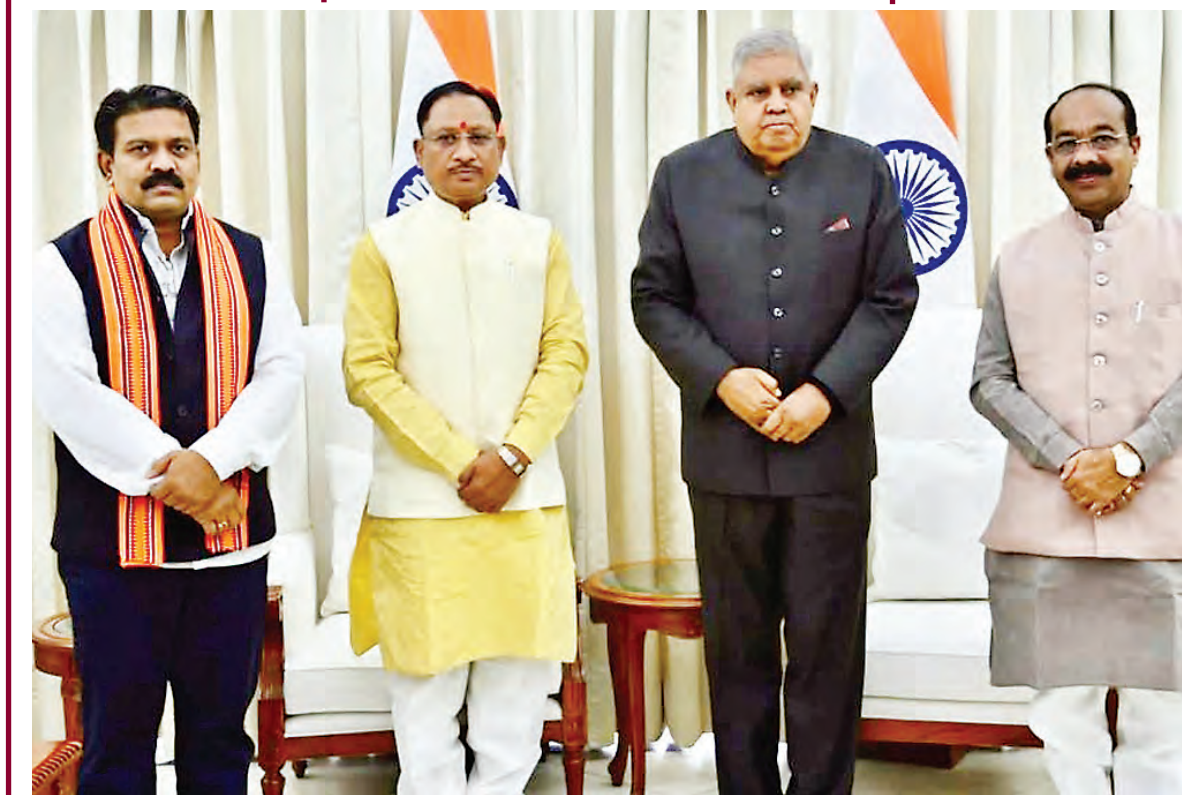
The Chief Minister Vishnu Deo Sai paid courtesy visit to the Vice President of India Jagdeep Dhankhar at V-P's official residence in New Delhi on Saturday. The Dy. CMs Arun Sao and Vijay Sharma also accompanied him.