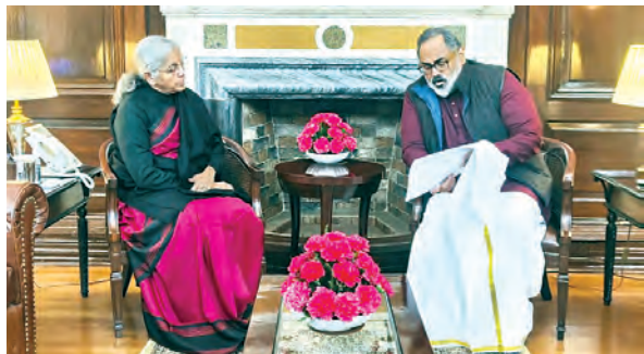
Union Finance Minister Nirmala Sitharaman interacts with Union Minister of State for Entrepreneurship, Skill Development and Electronics and Technology Rajeev Chandrasekhar during a meeting, in New Delhi.

Union Minister Nirmala Sitharaman said the Centre has released Rs 900 crore in two installments to Tamil Nadu in the current financial year, to deal with the havoc caused by the unprecedented rainfall and flooding. A total of 31 people died in four southern districts owing to the heavy rainfall that occurred early this week, the Finance and Corporate Affairs Minister said. Briefing reporters here, the natural calamity has claimed human lives and caused damage to infrastructure and communication systems. Extending her con-