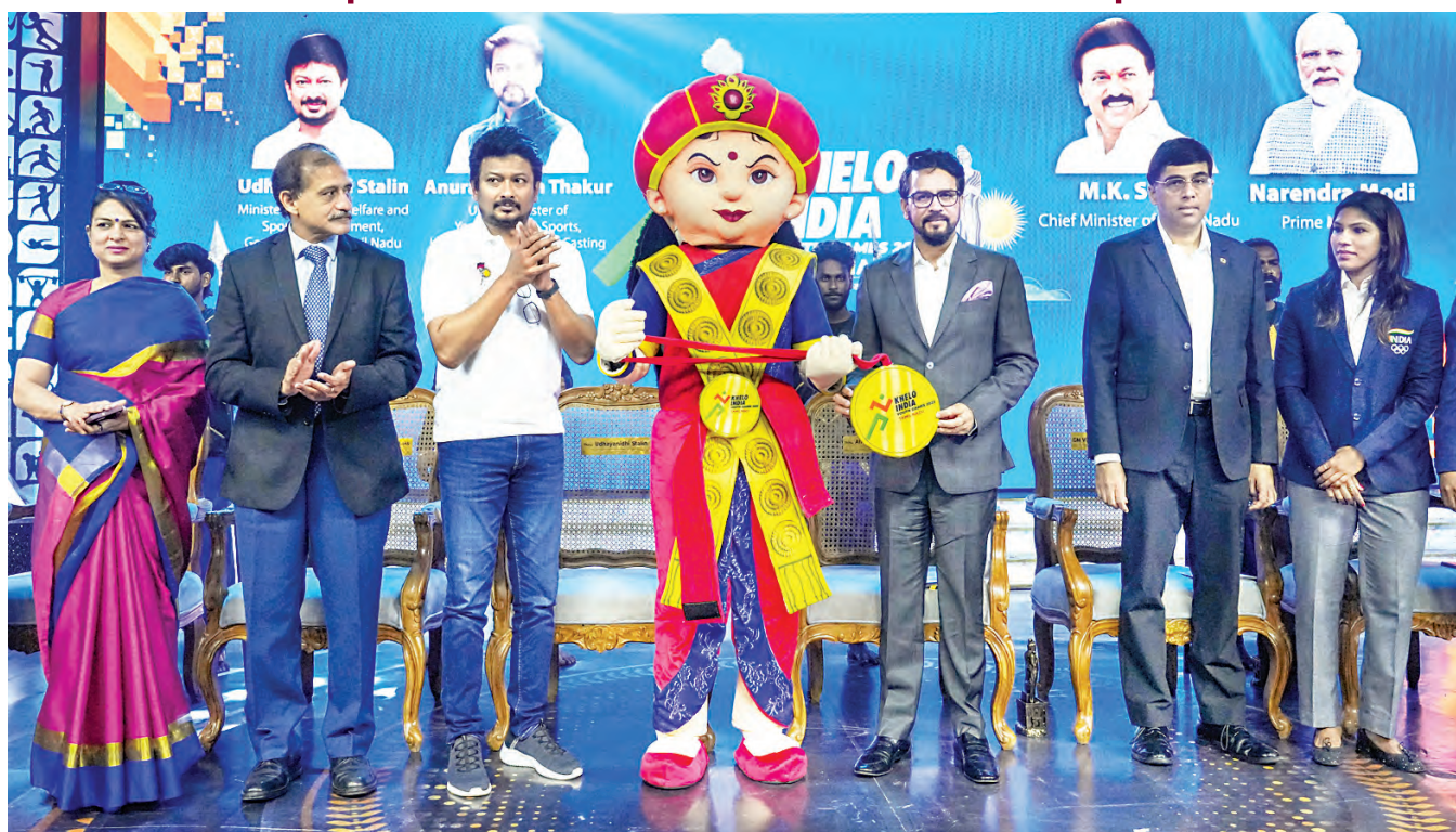
Union Minister for Youth Affairs & Sports Anurag Thakur and Tamil Nadu Minister for Youth Welfare & Sports Development Udhayanidhi Stalin with former world chess champion Viswanathan Anand during the launch of the logo, mascot and torch of the Khelo India Youth Games 2023, in Chennai.