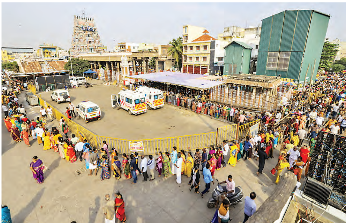
Devotees wait in queues to offer prayers at the Parthasarathy temple on the occasion of 'Vaikuntha Ekadashi', in Chennai, Saturday.