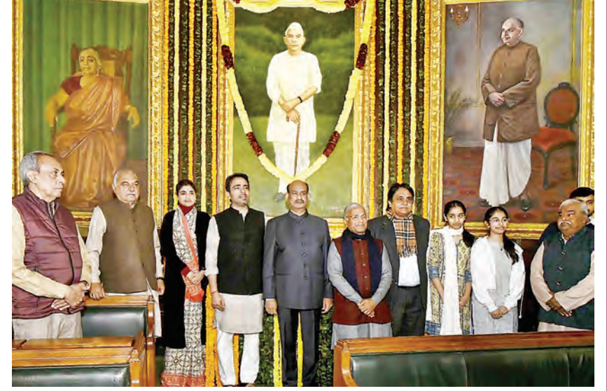
LS Speaker Om Birla and other leaders pay homage to former prime minister Charan Singh on his birth anniversary, at the Central Hall of Samvidhan Sadan, in New Delhi, Saturday.