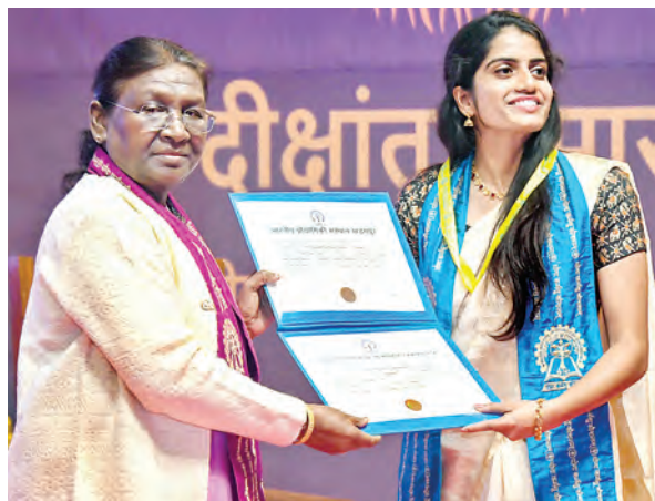
President Droupadi Murmu during the 69th convocation of IIT Kharagpur, Monday.

The President was happy to note that in line with the government of India's policy of internationalisation and globalisation of IITs, IIT Kharagpur is working on alliances and col-