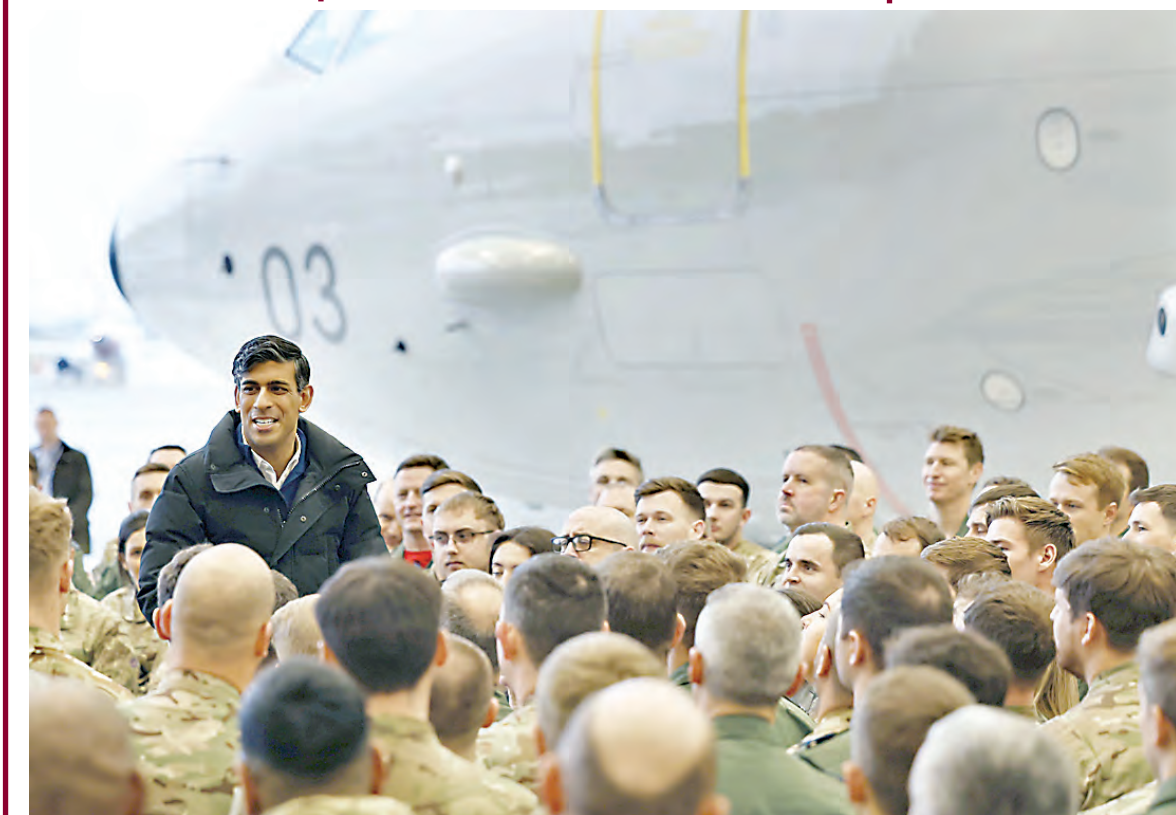
Britain's Prime Minister Rishi Sunak speaks, during a visit to RAF Lossiemouth military base to praise members of the RAF, Army and Navy who will spend time away from their families this Christmas while on duty, in Moray, Scotland, Monday.