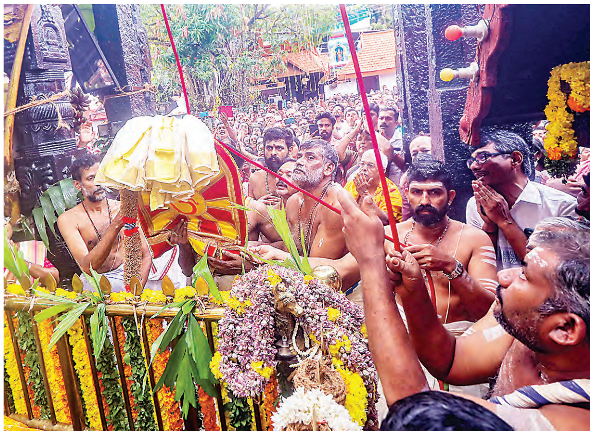
Devotees gather during the flag hoisting ceremony (Kodiyettam) of the annual festival at the Sreekanteshwaram Temple, in Thiruvananthapuram, Monday.