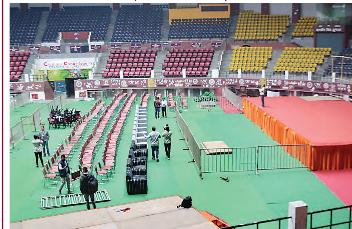
Stage is set for the oath ceremony of the Ministers of CM Vishnu Deo Sai at city's indoor stadium likely tomorrow before the start of the State Assembly winter session.