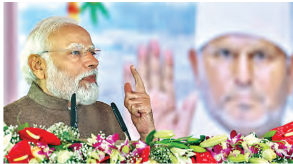
PM Modi addresses during the inauguration of Swarved Mahamandir, in Varanasi, Monday.

"After seven decades of Independence, the wheel of time has turned once again. The country has declared from the Red Fort freedom from a slave men-