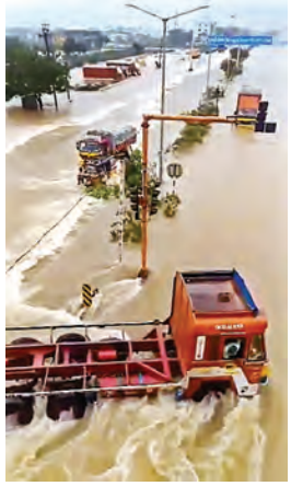
The flooded Thoothukudi - Tiruchendur highway following heavy downpour, Monday.