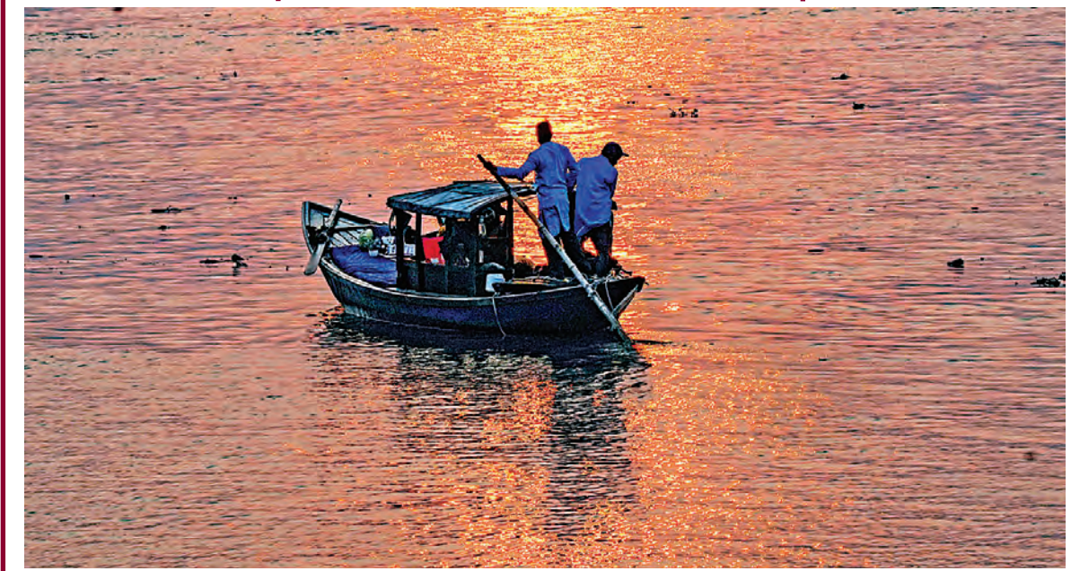
A boat silhouetted against the setting sun on the River Ganga in Kolkata, Monday.