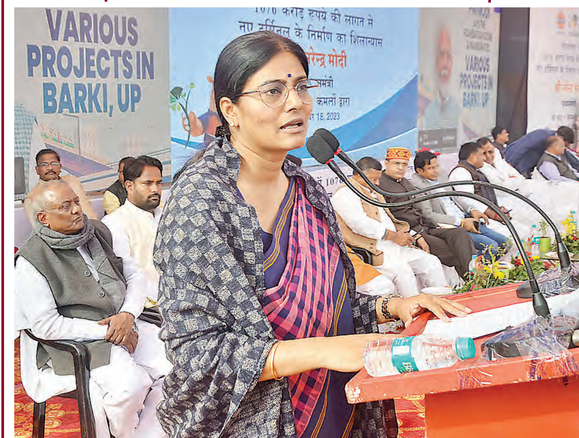
Union Minister and Apna Dal (Sonela) National President Anupriya Patel addresses during Prime Minister Narendra Modi's virtual foundation stone laying program of India's largest Indian Oil Terminal in Dagmagpur, in Mirzapur, Monday, Dec. 18.