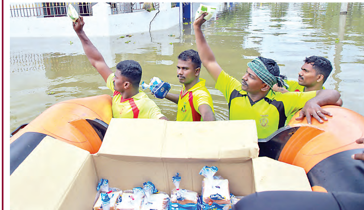
Rescue workers provide water and other relief material to flood-hit people in Kanyakumari, Monday.