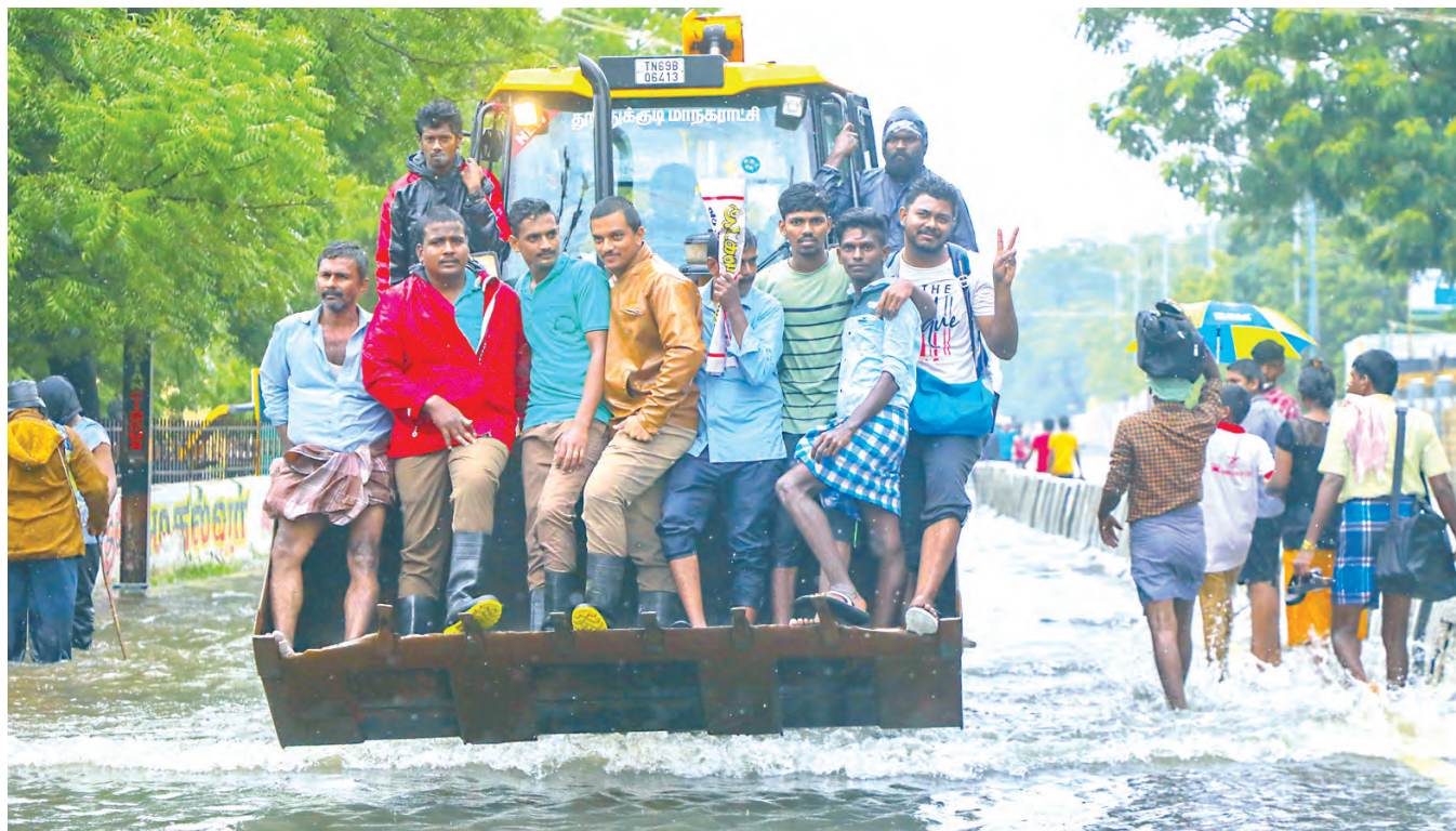
People shift to safe places from a flood-hit area following heavy rains, in Thoothukudi, Monday, Dec. 18.