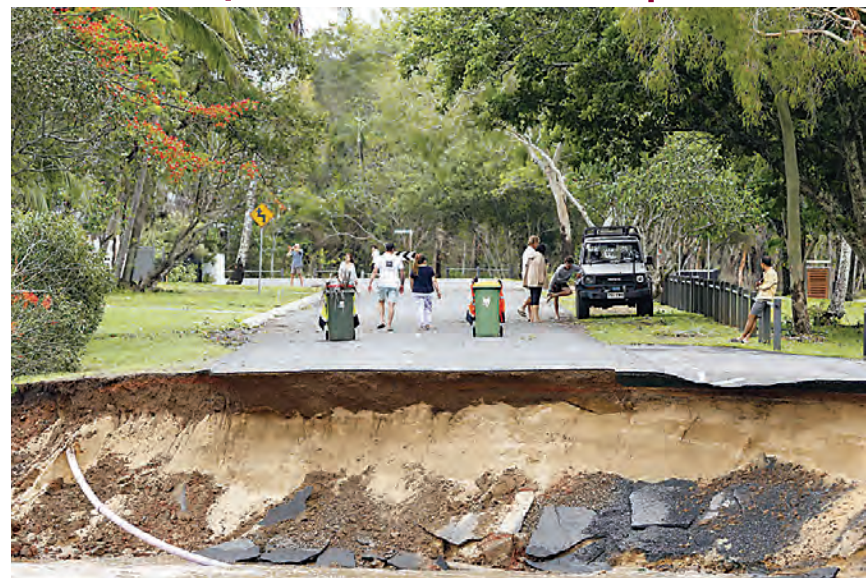
Stranded residents stand on a road, a large section of which has washed away, in the suburb of Holloways Beach in Cairns, Australia, Monday. Officials say more than 300 people have been rescued from floodwaters in northeast Australia, with dozens of residents clinging to roofs.