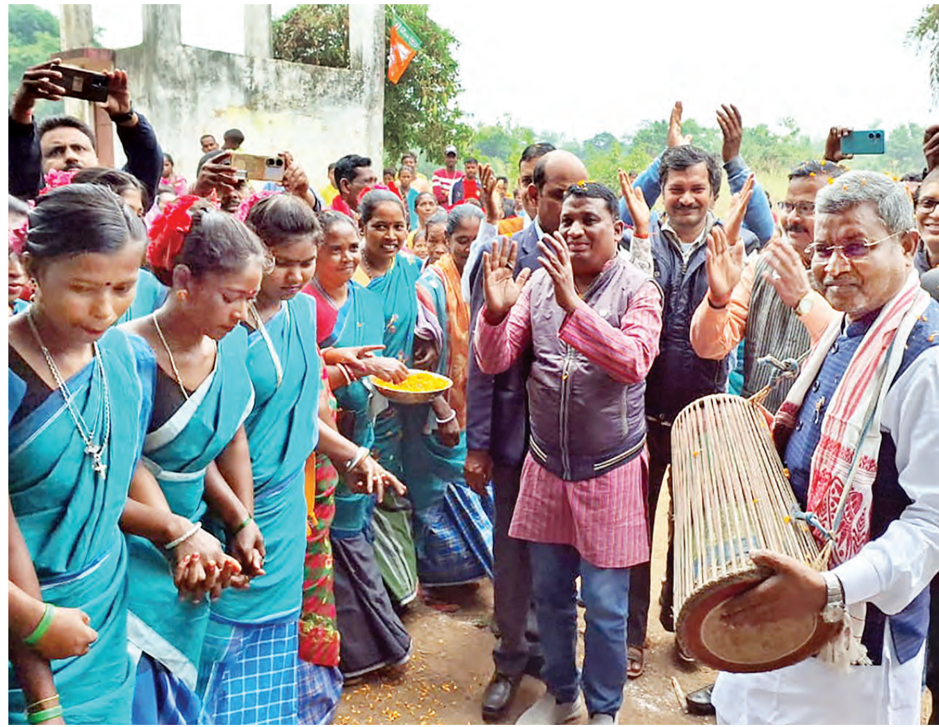
Jharkhand BJP President Babulal Marandi plays with a traditional drum 'Mandar' during the start of 'Adhikar Yatra', in Pakur, Jharkhand, Wednesday, Nov. 6.