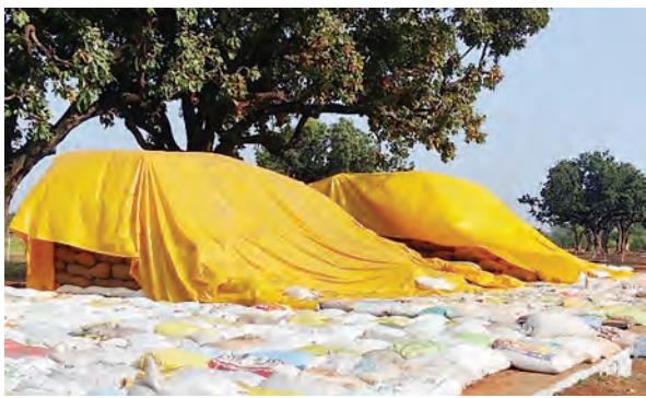
Kurud, Dec 06:

Due to cyclonic storm Michong, the weather of rural areas including Kurud city kept changing every moment throughout the day. The Meteorological Department had also issued a bulletin regarding cyclonic storm Michaung, due to cloudy sky since