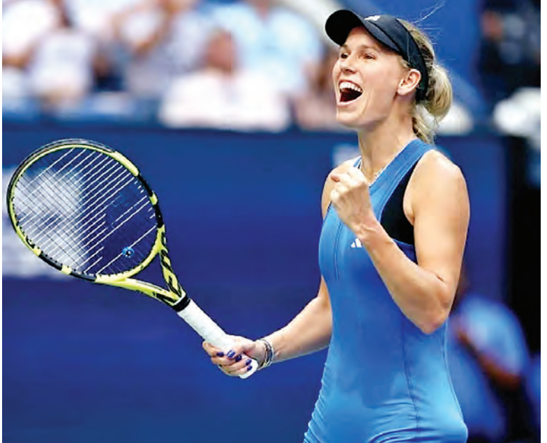
Melbourne, Dec 06

Former No. 1-ranked Caroline Wozniacki has been awarded one of the first wild cards for the 2024 Australian Open and is planning on bringing her two young children to the scene of her biggest Grand Slam triumph. Wozniacki, the 2018 Australian Open women's champion, and six Australian players were granted the first batch of wild cards. The 33-year-old Wozniacki returned to top-flight tennis in August after more than three years off the tour. She played in Montreal and Cincinnati before making a run to the fourth round of the US Open, where she lost to eventual champion Coco Gauff. "I have so many wonderful memories of Melbourne, and of course winning the Australian Open is an all-time career highlight," Wozniacki, ranked No. 242 this week, told Australian Open organizers on Wednesday. Wozniacki won her only Grand Slam singles title in Australia a couple of years before she left the sport in early 2020 to start a family. She spent time working as a TV analyst, and now, she and former NBA play-