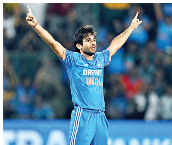
Dubai, Dec 09 (PTI):

Young Indian leg-spinner Ravi Bishnoi on Wednesday rose to the top spot in the ICC T20I bowling chart on the back of his recent performance against Australia. The 23-year-old was India's go-to bowler in the just-concluded series against Australia, taking nine wickets from five games. Bishnoi, who is on 699 rating points, has jumped five places to displace Afghanistan spinner Rashid Khan (692) from the top slot. Sri Lankan spinner Wanindu Hasaranga and England's Adil Rashid, who both