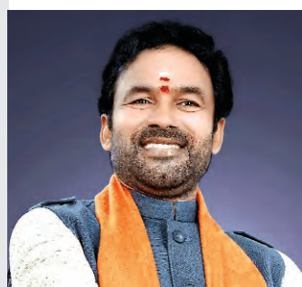
G. Kishan Reddy

Every time I travel to the north eastern region, I often slide down the memory lane, reminiscing my earlier visits with my fellow yuvamorchakaryakartas from across India. Those days, paying little heed to the lack of connectivity, the looming security threat, the inconvenience of bandhs and chakkas jams and absence of basic infrastructure, we treasured the opportunity to interact with our brothers and sisters from the region, experiencing their culture and discussing challenges and solutions.