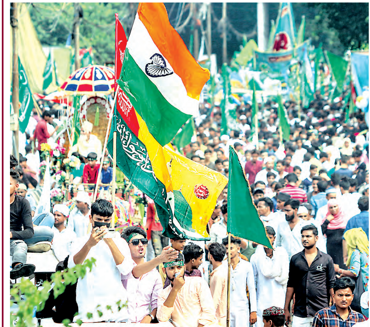
Muslims take part in a procession on the 12th 'Rabi-al-Awwal', in Lucknow, Thursday.