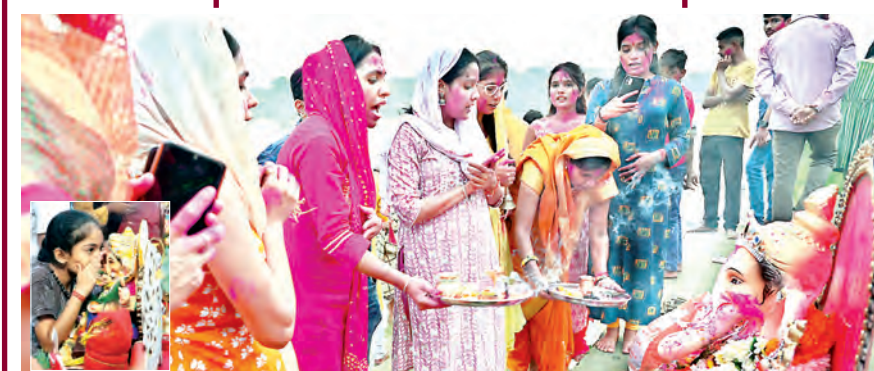
Devotees bid touching farewells to Lord Ganesha on completion of 10-days of worship in Kharun River.