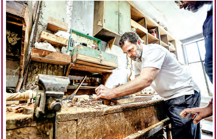
Congress leader Rahul Gandhi during his visit to the furniture market, at Kirtinagar in New Delhi, Thursday.