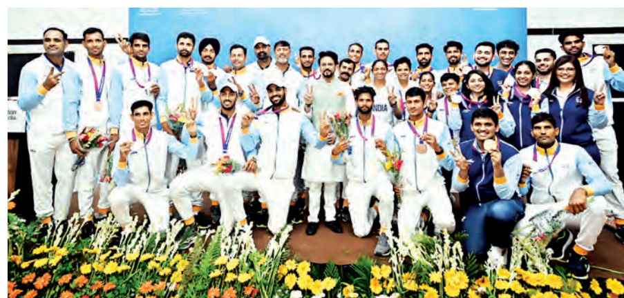
Union Minister for Youth Affairs and Sports Anurag Thakur with the medallists of the 19th Asian Games during their felicitation ceremony at the Constitution Club of India, in New Delhi, Thursday.