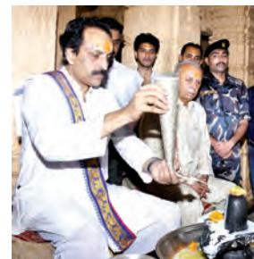
ISRO Chief S Somanath offers prayers at Aadi Jyotirling Shree Somnath Mahadev Temple, in Saurashtra, Thursday.

Chairman of the Indian Space Research Organisation (ISRO) S Somanath on Thursday said the Pragyan rover of its moon mission Chandrayaan-3 has done what it was expected to do, and it would not be a problem even if it fails to 'wake up' from the current sleep mode. The national space agency is now gearing up for XPOSat or X-ray Polarimeter Satellite launch which may take place in November or December, he said at a news conference here after visiting the famous Somnath