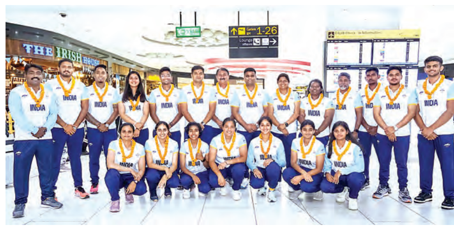
Indian Archery squad pose for a photo before leaving for the ongoing 19th Asian Games in China, in New Delhi.

"...We are the ones to beat, and perhaps the only