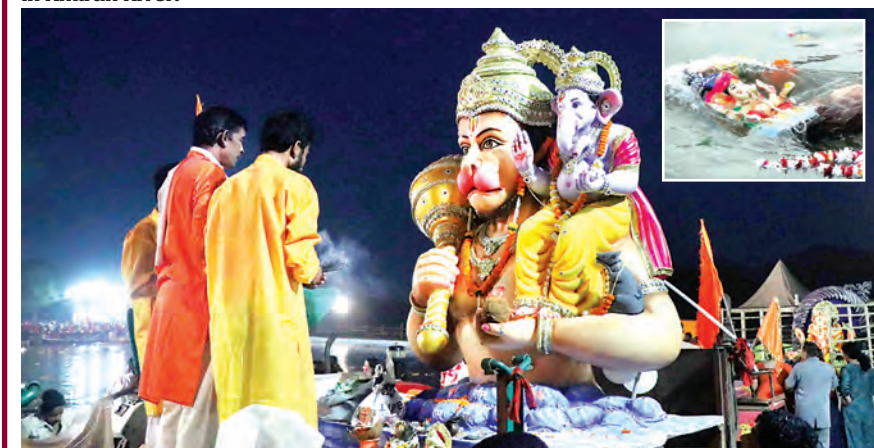
Large idols of Lord Ganesha too were immersed in the pond constructed for it and before that devotees offered prayers to Lord Ganesha