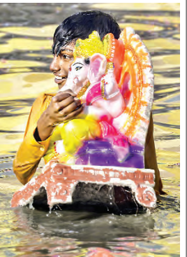
Devotee immerses an idol of Lord Ganesha in a pond on the occasion of Anant Chaturdashi, at Geeta Colony in New Delhi, Thursday.