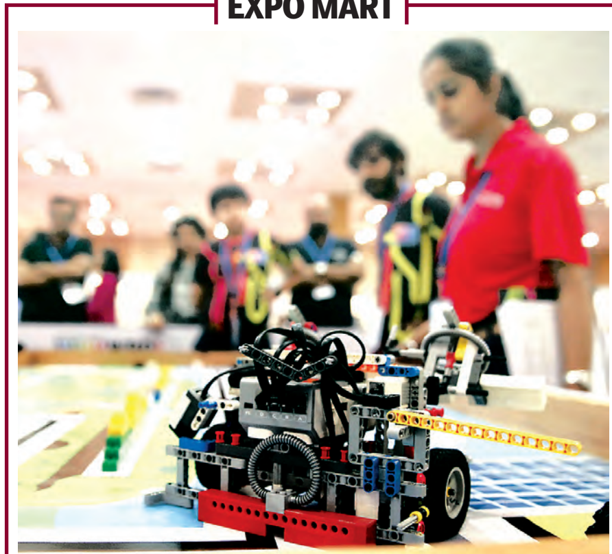
A robot at the World Robot Olympiad, at Expo Mart in Greater Noida, Thursday, Sept. 28.