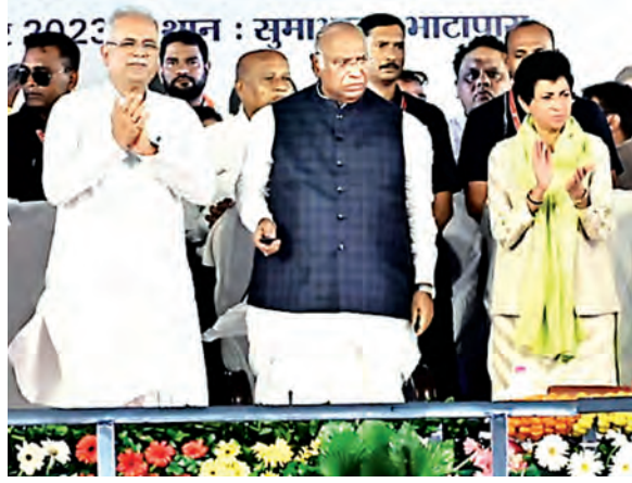
Congress President Mallikarjun Kharge and Chief Minister Bhupesh Baghel during a public meeting, in Baloda Bazar, Thursday.

Addressing a 'Krishak-sah-Shramik Sammelan' (farmers-cum-labourers convention) of the Chhattisgarh government in Sumabhata village in Balodabazar-Bhatapara district, Kharge said the