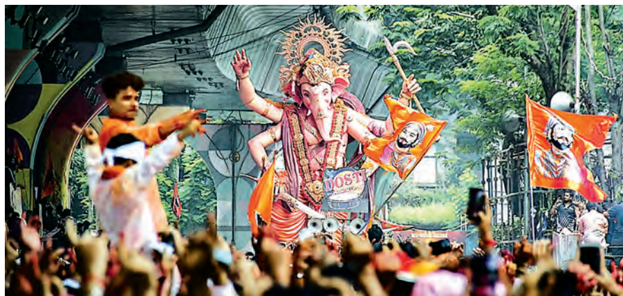
Devotees take part in a procession for immersion of an idol of the Hindu god Lord Ganesha into the Arabian Sea, in Mumbai, Thursday.

In Mumbai's Lalbaug area, famous for celebrating the festival with grandeur, the procession of idols of Tejukaya and Ganesh Gully mandals started with chants of