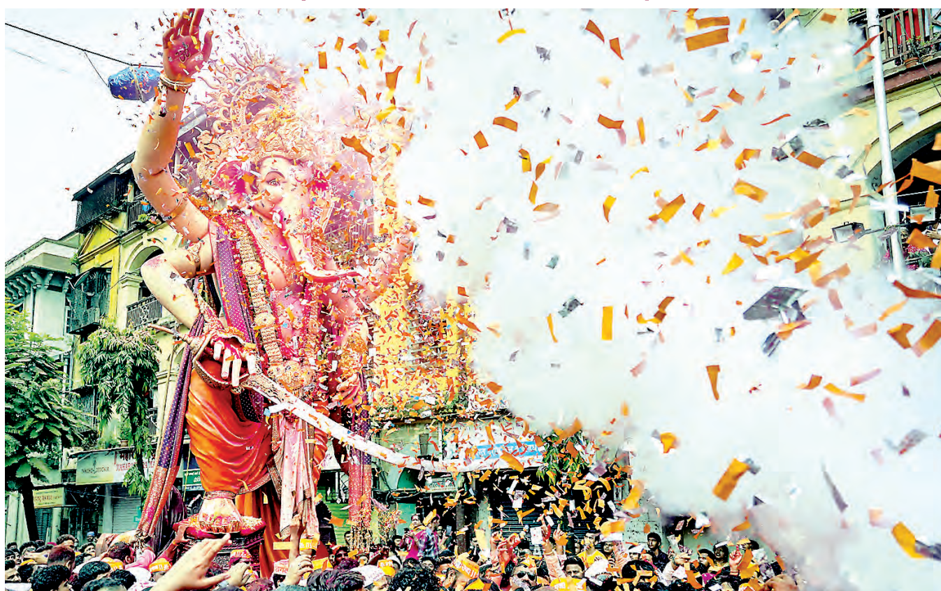
Devotees celebrate during a procession on the occasion of 'Ganesh Visarjan' as part of the 'Ganesh Chaturthi' festivities, in Mumbai, Thursday, Sept. 28.