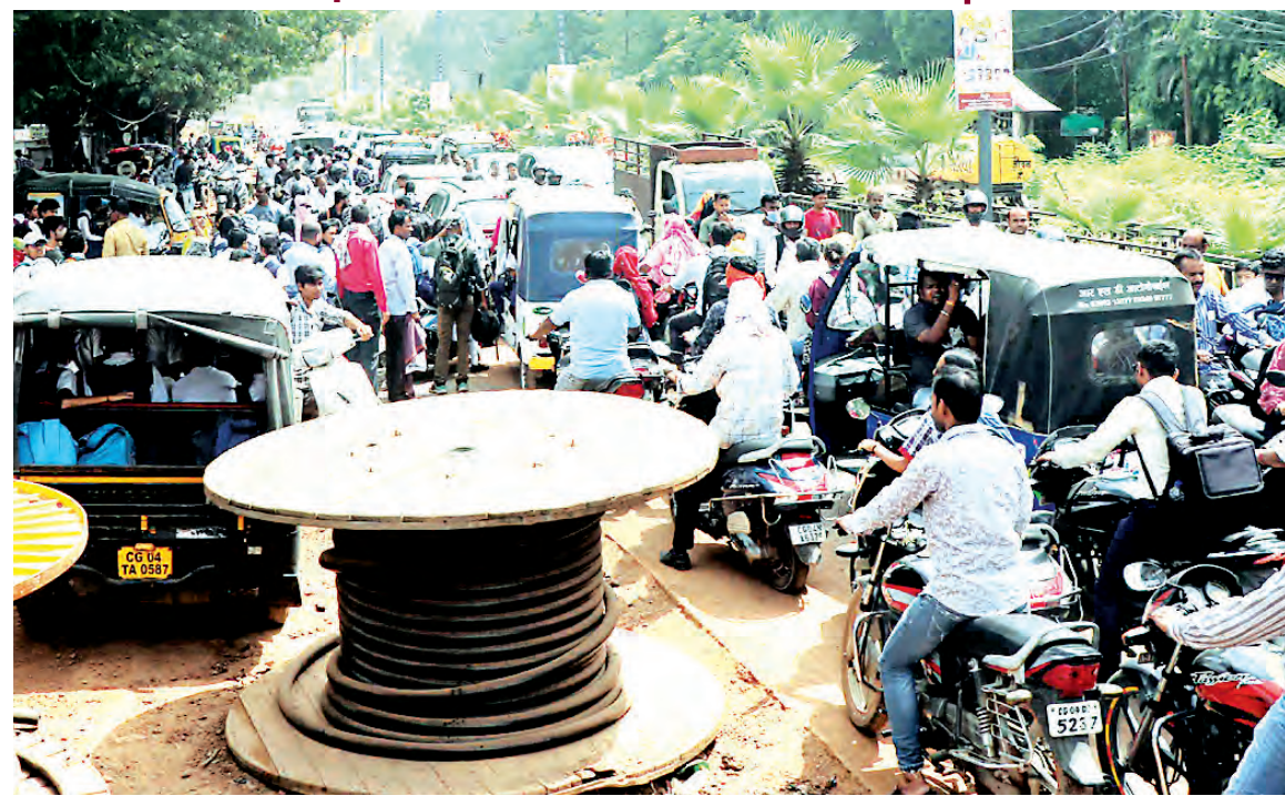
With laying of cable work on the road near Salem School, the day-to-day traffic is getting badly affected and causing traffic congestion during peak hours.