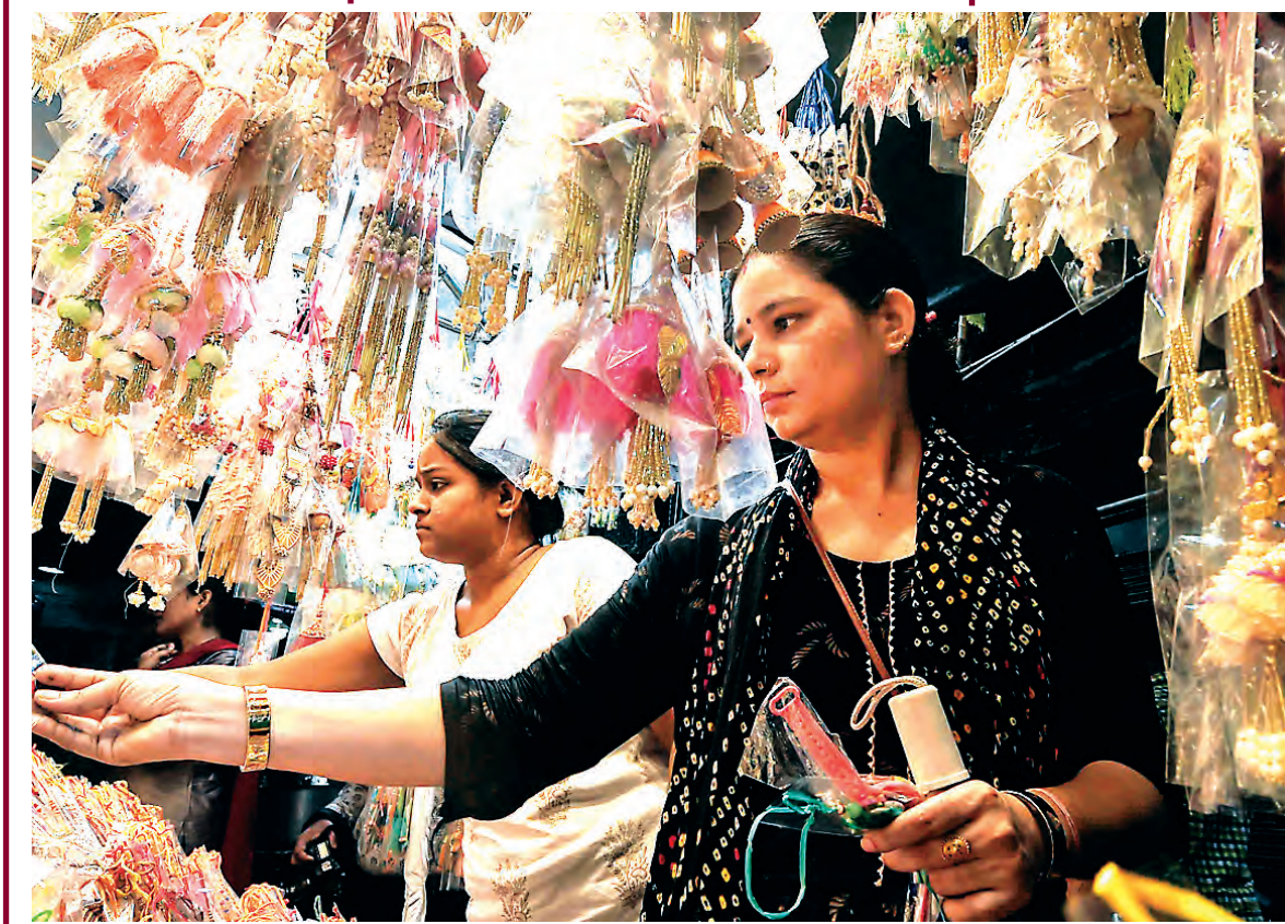
Women buy 'rakhi' ahead of 'Raksha Bandhan' festival, in Kolkata, Tuesday.