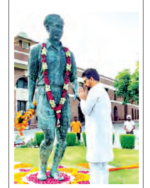
Union Youth Affairs & Sports Minister Anurag Thakur pays tribute to hockey legend Major Dhyan Chand on the National Sports Day, at National Stadium in New Delhi, Tuesday.