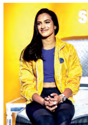
Badminton player and new brand ambassador for Century Mattress PV Sindhu at an event, in Hyderabad, Tuesday.

"We are elated to welcome P V Sindhu to the Century family as our new brand ambassador. Sindhu is a perfect fit for Century through shared