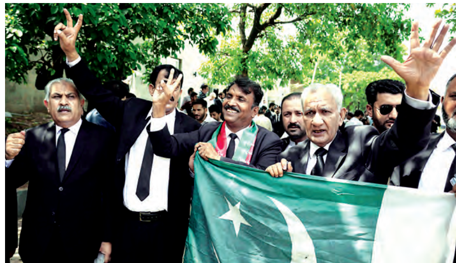
Lawyers and supporters of Pakistani imprisoned former Prime Minister Imran Khan react after court decision, in Islamabad, Pakistan, Tuesday, Aug. 29. A Pakistani appeals court on Tuesday suspended the corruption conviction and three-year prison term of Khan in a legal victory for the embattled former prime minister, his lawyer said.