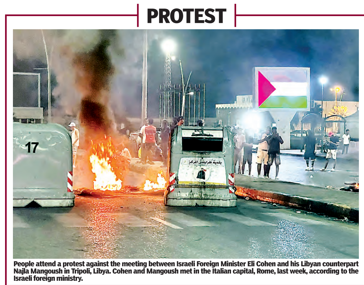
People attend a protest against the meeting between Israeli Foreign Minister Eli Cohen and his Libyan counterpart Najla Mangoush in Tripoli, Libya. Cohen and Mangoush met in the Italian capital, Rome, last week, according to the Israeli foreign ministry.

Cleverly's visit is an attempt to stabilize China-Britain ties, which have sunk to their lowest level in decades. The countries disagree over issues such as Beijing's curbing of civil freedoms in Hong Kong, a former British colony, alleged human rights abuses in the Xinjiang