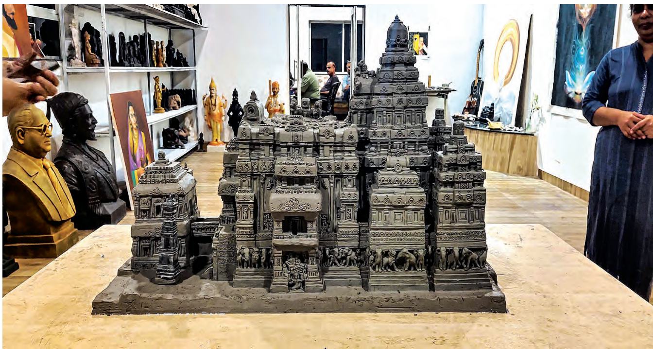
The replica of the sculpture of Ellora temple being made for IATO's 38th Convention scheduled in Aurangabad from September 29 to Oct 1.