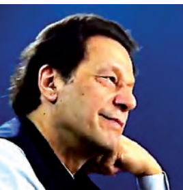
In Toshakhana case