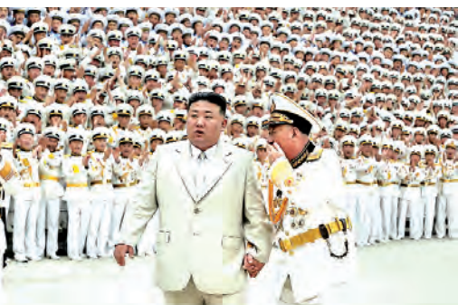
North Korean leader Kim Jong Un, center, visits the navy headquarter in North Korea. Independent journalists were not given access to cover the event depicted in this image distributed by the North Korean government. The content of this image is as provided and cannot be independently verified. Korean language watermark on image as provided by source reads: "KCNA" which is the abbreviation for Korean Central News Agency.