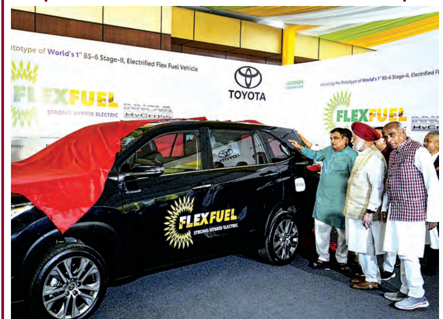
Union Minister for Road Transport and Highways Nitin Gadkari and Union Minister for Petroleum and Natural Gas Hardeep Singh Puri during the unveiling of the world's first prototype of the BS 6 Stage II 'Electrified Flex Fuel Vehicle' developed by Toyota Kirloskar Motor, in New Delhi, Tuesday.

Stock markets close higher for 2nd day; power, metal shares lead gains