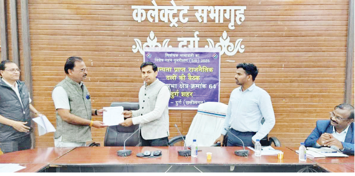
Meeting at Durg City constituency.

Electoral Officers brief political representatives on 2026 Special Intensive Revision