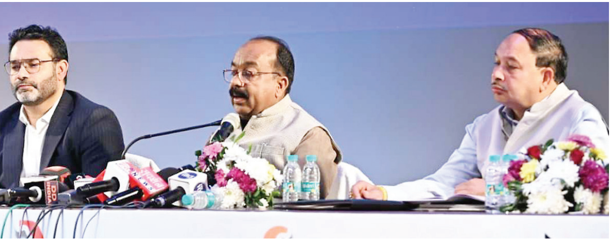
Central Chronicle News

Over Rs 8,092 crore worth of PWD projects approved in two years, with 608 new roads planned in the coming year.