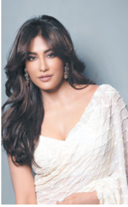
Chitrangda Singh radiates grace and gratitude on set.

Bollywood actress Chitrangda Singh, known for choosing roles rich in depth over mere screen presence, has reflected on her career with gratitude, acknowledging that even a limited body of work can leave a lasting impact. She feels fortunate that audiences remember her performances, despite not being constantly in the spotlight. In 2025, Chitrangda made waves with films like Housefull 5, Parikrama, and Raat Akeli Hai: The Bansal Murders, each allowing her to showcase nuanced performances. She believes memorability stems from quality rather than quantity. “Sometimes just one scene kind of eats into a bigger part and makes a mark,” she said, emphasizing that while visibility is important, substance endures. From her 2003 debut in Hazaaron Khwaish-ein Aisi to films like Yeh Saali Zindagi and Inkaar, Chitrangda has consistently gravitated toward emotionally layered characters.