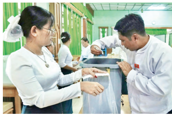
Official of the Union Election Commission prepare to close a polling station after the votes are counted, during the first phase of general election, in Naypyitaw, Myanmar.

Voting is taking place in three phases due to ongoing armed conflicts, with the first round held Sunday in 102 of Myanmar's 330 townships. The remaining phases will take place on January 11 and January 25, but 65 townships won't partici-