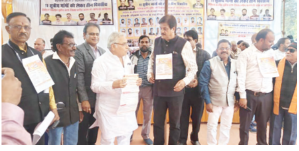
Protesting employees at the dharna site.