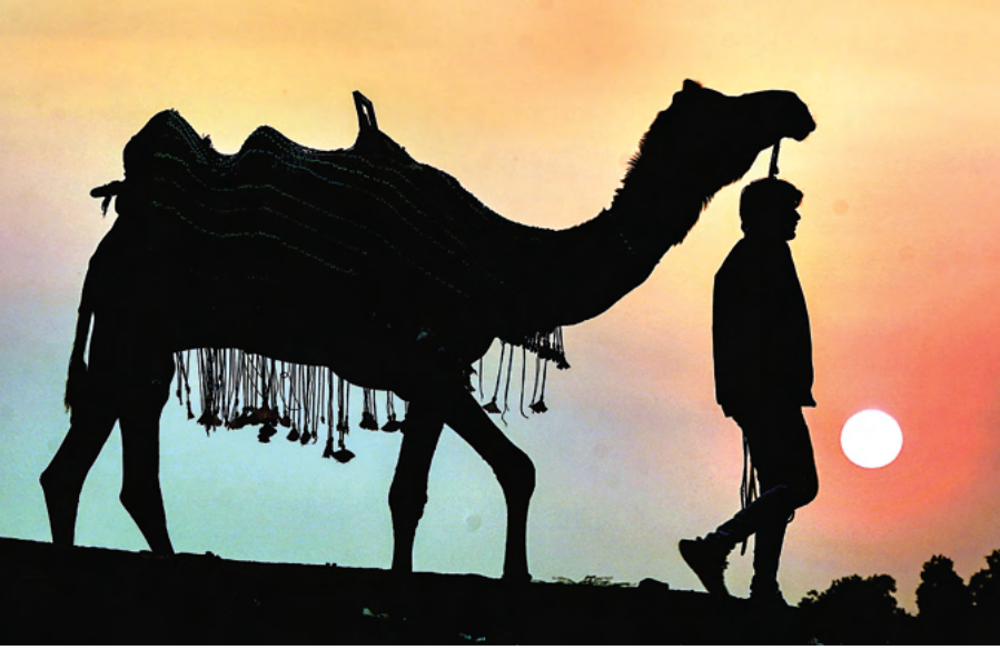
A silhouetted camel rider leads his camel across the desert as the sun sets, in Pushkar, Rajasthan, Tuesday.