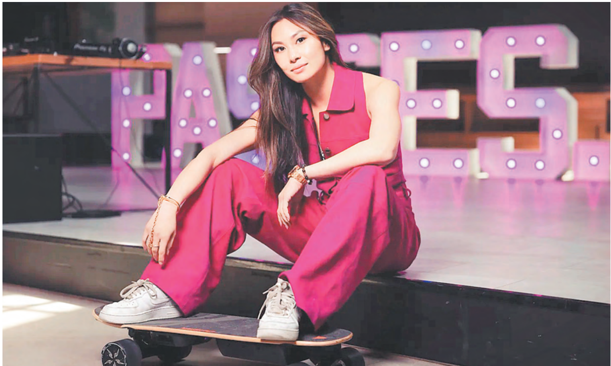
The next tech revolution has a woman's perspective