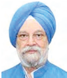
Hardeep S Puri, Union Minister for Petroleum & Natural Gas, Gol

ity. In December, India signed a Comprehensive Economic Partnership Agreement with Oman, strengthening a strategic corridor for goods, services, and investment. India also concluded negotiations for a free trade agreement with New Zealand, expanding reach into highvalue markets and setting a template for disciplined, commercially meaningful agreements. India’s startup sector expanded to over 2 lakh governmentrecognized firms, creating more than 21 lakh jobs. The Open Network for Digital Commerce (ONDC) processed over 326 million orders, averaging 5.9 lakh daily transactions. The Government eMarketplace (GeM) saw cumulative transaction value cross 16.41 lakh crore, with 11 lakh micro and small enterprises receiving orders worth 7.35 lakh crore. India rose to 38th place among 139 economies in the Global Innovation Index. Simplification efforts reduced over 47,000 compliances and decriminalised 4,458 legal provisions. By late November, the National Single Window System processed more than 8.29 lakh approvals. Infrastructure planning advanced as the PM GatiShakti National Master Plan opened to the private sector, while the Project Monitoring Group portal onboarded over 3,000 projects valued at 76 lakh crore. Embracing trustbased governance, Parliament passed the Repealing and Amending Bill 2025, clearing 71 obsolete Acts. Ease of doing business moved closer to entrepreneurs through districtlevel reform frameworks, including the Dis-