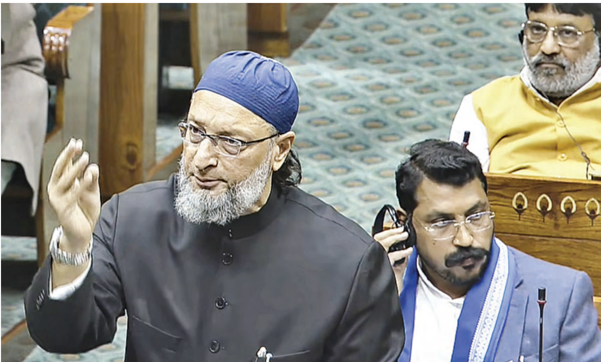
MP Asaduddin Owaisi speaks in the LS during the Winter session of Parliament.

right to vote a fundamental right. "I would like to point out at the outset that SIR is violative of parliamentary legislation. It violates the rights prescribed by Parliament and it is contrary to a judgement of