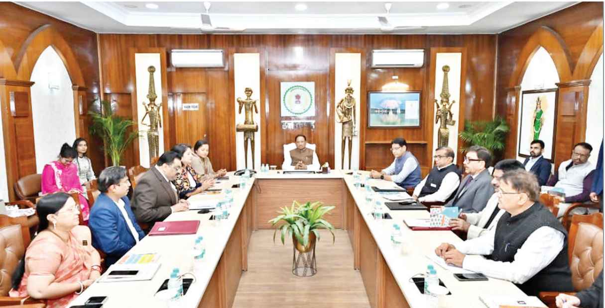
State Commission for Protection of Child Rights signed a MoU with six universities of the state for the implementation of the “Rakshak Curriculum”.