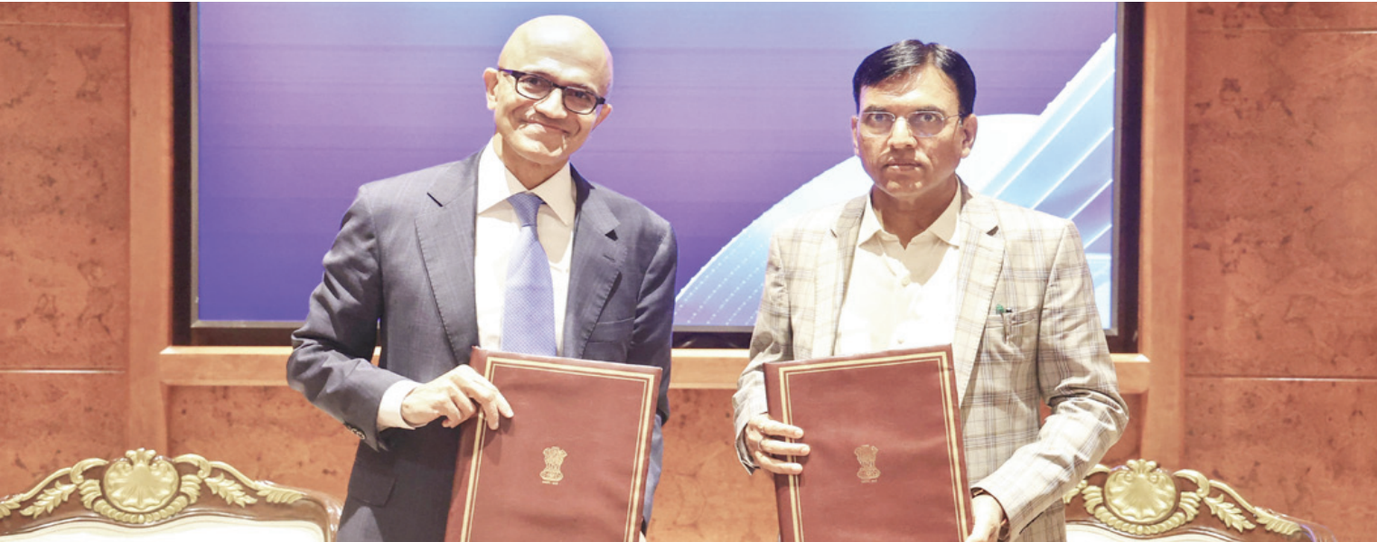
Union Minister Mansukh Mandaviya, right, with Microsoft CEO Satya Nadella after signing an MoU between the Ministry of Labour & Employment and Microsoft on December 10, Wednesday in New Delhi.