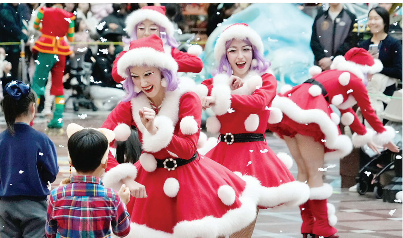
Employees wearing Santa Claus costumes perform during a parade for celebrating Christmas at Lotte World Adventure in Seoul, South Korea.

European leaders across the political spectrum are uniting to call for tougher migration policies.