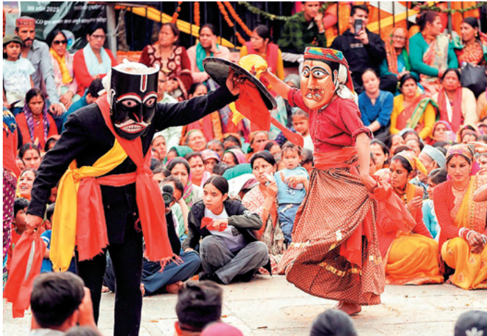
A glimpse of Goa’s culture brought alive this December.

ber 12 to 21, the festival transforms the site into an evolving museum of ideas. A key exhibition delves into Goa’s oceanic past, colonial encounters, and the influences that have shaped the region’s layered identity. Through installations and multimedia works, it highlights how migration, trade, and cultural exchange continue to define Goan life.