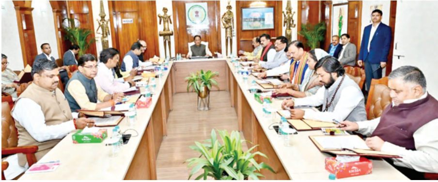
Chief Minister Vishnu Deo Sai chairing meeting of Chhattisgarh cabinet held at CM House in Civil Line here.

The decision has been taken in accordance with provisions of the Chhattisgarh Naxalite Surrender/Victim Relief and Rehabilitation Policy-2025, which provides for considering the disposal of cases registered against surrendered cadres, taking into