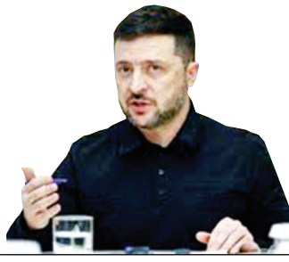
Ukraine can hold elections within months if security is ensured. Volodymyr Zelenskyy President of Ukraine