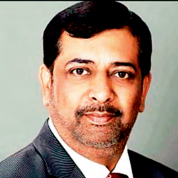
Central Chronicle, Raipur/Mumbai.