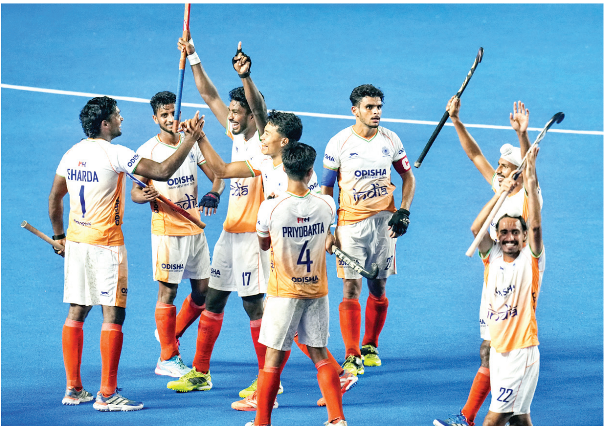
India's players celebrate after winning the FIH Junior Men's Hockey World Cup bronze medal match between India and Argentina, at Mayor Radhakrishnan Hockey Stadium, in Chennai, Tamil Nadu, Wednesday.