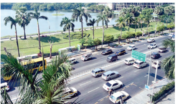
A high-angle view of a busy road with famous Inya Lake in the background in Yangon, Myanmar, Wednesday, Dec. 10, 2025. Critics of army rule in Myanmar stage silent strike against upcoming election.

BANGKOK: Opponents of military rule in Myanmar staged a joint protest on Wednesday calling on people to stay indoors to show they are boycotting elections scheduled for late this month. They defied harsh legal penalties for attempting to disrupt the polls. The military government has announced charges against 10 pro-democracy activists who staged a rare street protest last week in Mandalay, the country's second biggest city. Critics say the Dec 28 polls will be neither free nor fair and are an effort by the military to legitimise its rule after seizing power from the elected government