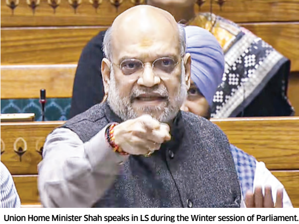
Union Home Minister Shah speaks in LS during the Winter session of Parliament.

Central Chronicle News NEW DELHI: In a stinging attack at the Opposition over its criticism of the SIR, Home Minister Amit Shah on Wednesday said they worried because they can no longer win elections by corrupt practices and claimed that the reason for Congress’ defeat in polls was its leadership and not EVMs or “vote chori”. Intervening in a debate on election reforms in the Lok Sabha, Shah alleged that the Opposition is raising the issue of Special Intensive Revision (SIR) of electoral rolls to keep “avaidh ghuspathiye (illegal immigrants)” in the voters’ list. When the opposition MPs walked out later, Shah said no matter how many times the Opposition boycotts, the NDA will continue with its policy of detect, delete and deport ‘ghuspathiye’. The Opposition wants to normalise