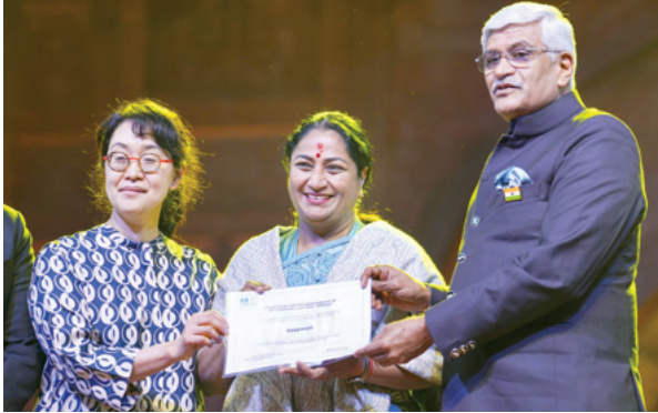
UNESCO's Fumiko Ohinata handed the Deepavali heritage certificate to Delhi CM Rekha Gupta and Culture Minister Shekhawat.

Press Trust Of India NEW DELHI: India’s Deepavali -- the festival of lights -- was on Wednesday inscribed on the UNESCO’s Representative List of the Intangible Cultural Heritage of Humanity, sparking celebrations to mark the earning of the coveted tag. The decision was taken during a key meeting of UNESCO being hosted at the Red Fort in Delhi. Chants of ‘Jai Hind’, ‘Vande Mataram’ and ‘Bharat Mata ki Jai’ rent the air as UNESCO announced that the celebrated festival has been added to the prestigious list after a discussion by its committee. Artistes dressed in different