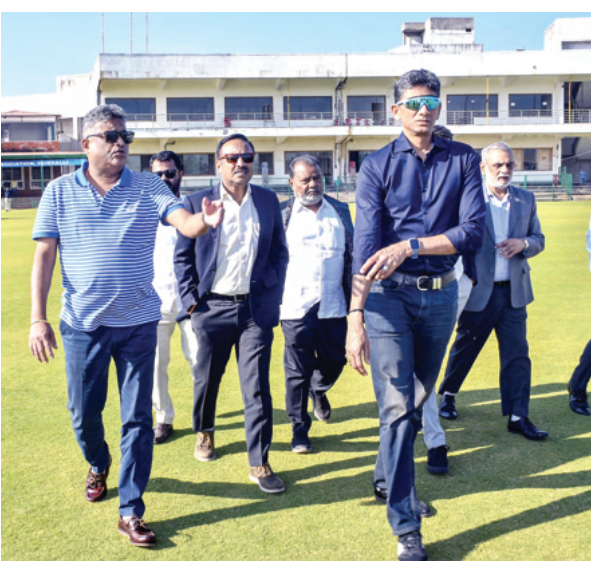
Newly-elected President of the Karnataka State Cricket Association (KSCA) Venkatesh Prasad with other members during a visit to the stadium, in Hubballi, Dharwad district, Karnataka, Wednesday.

The stadium hasn't hosted top-tier matches since a stampede outside the ground claimed 11 lives during the Royal Challengers Bengaluru's