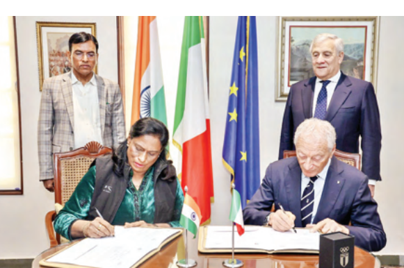
(IOA) President P T Usha and Italian National Olympic Committee (CONI) President Luciano Buonfiglio sign a Memorandum of Understanding (MoU) to strengthen bilateral cooperation in sports with a focus on training, infrastructure sharing and sports science collaboration, in New Delhi.

NEW DELHI: The Indian Olympic Association (IOA) and the Italian National Olympic Committee (CONI) on Wednesday signed a Memorandum of Understanding (MoU) to strengthen bilateral cooperation in sports