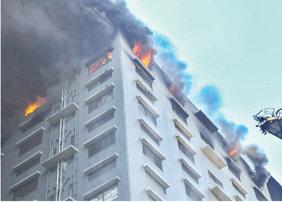
Fire fighters battle a blaze, at Raj Textile Market in Surat