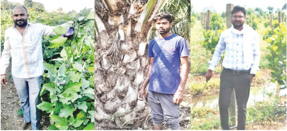
Farmers involved in horticulture crops production.

A large number of farmers are shifting towards horticulture crop cultivation