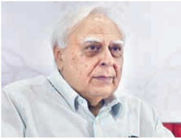
RS MP Kapil Sibal