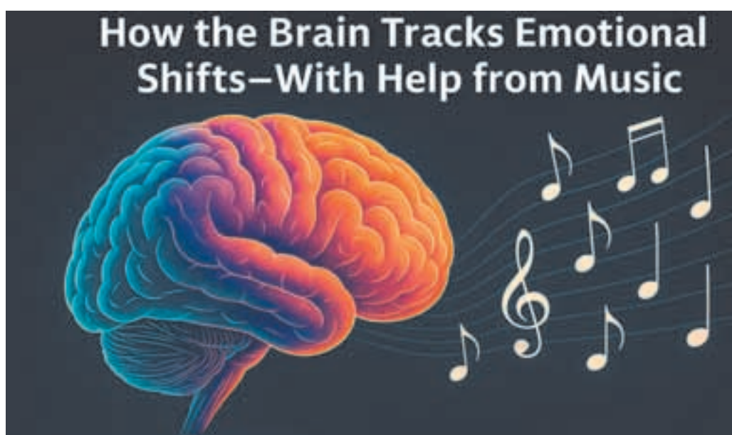
Symbolic pic Brain n Music

Scientists have found that our emotional responses are not isolated reactions but are deeply shaped by the emotional context that comes before. By Vijay Garg