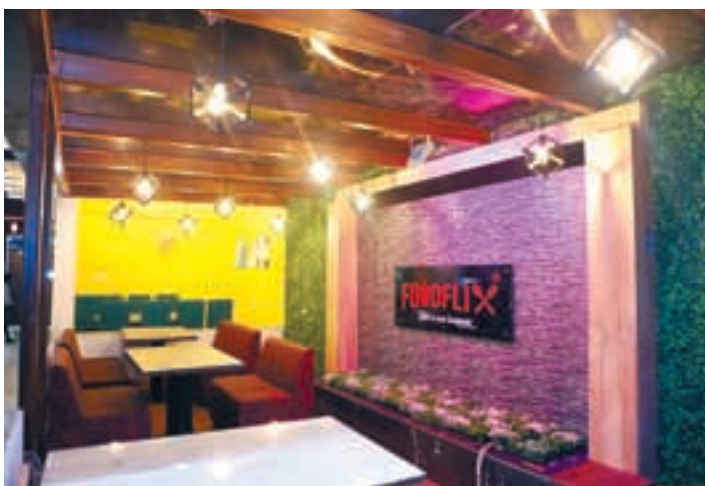
A fresh new look, but the taste you've always loved!