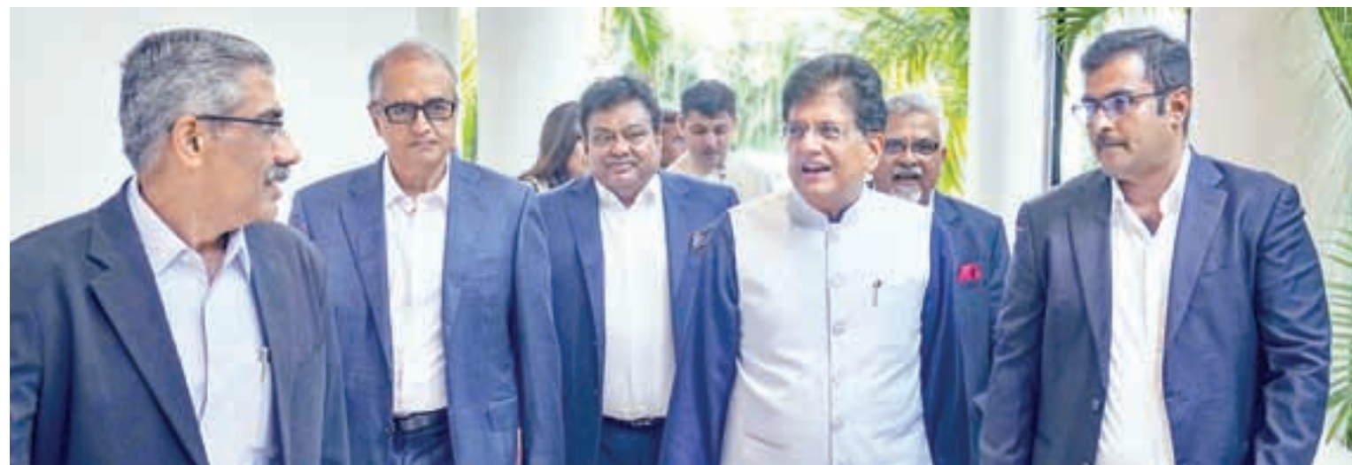
Union Minister Piyush Goyal, Karnataka Minister for Commerce and Industries M B Patil and CII officials during the 'Industry Interaction' organised by the CII, in Bengaluru on Saturday.