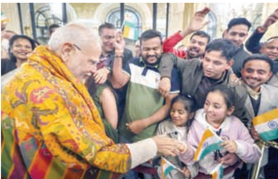
PM Modi being welcomed by members of the Indian community upon his arrival in Argentina.

This is the first Indian bilateral visit at the prime ministerial level to Argentina in 57 years. It is Modi's second visit to the country as prime minister; he had visited in 2018 for the G20 Summit. It also marks