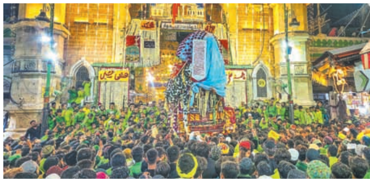
People carry 'tazia' during the 'Muharram' procession from the Nizam Gate of the Dargah, in Ajmer, Rajasthan.