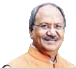
photo Brijmohan Cutout Emphasis on expanding BSNL services in rural and Naxal-affected areas.