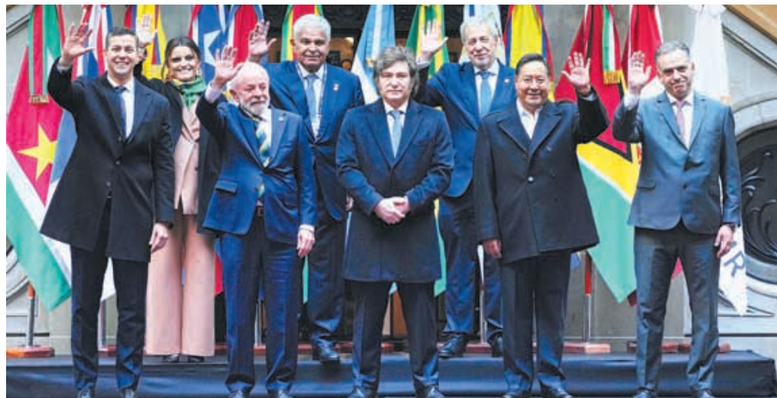
Argentina's President Javier Milei and Brazil's President Luiz Inacio Lula da Silva, along with other leaders posing after the Mercosur Summit held in Buenos Aires.