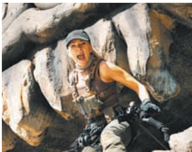
Scarlett Johansson and Jonathan Bailey share thrilling moments in Jurassic World Rebirth .

Jurassic World: Rebirth reignites the franchise with spectacle, heart, and a welcome return to core thrills, even if it occasionally stumbles. Gareth Edwards directs this sleek new chapter with a sharp eye for scale and a clear love for the original's DNA. Set five years after Dominion , the story follows covert agent Zora Bennett (Scarlett Johansson), tasked with retrieving dinosaur DNA from a remote tropical island. She is joined by palaeontologist Dr. Henry Loomis (Jonathan Bailey), ex-partner