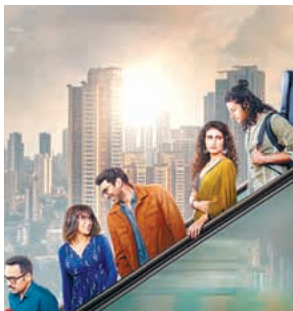
Anurag Basu's film, at its best, catches all those beats.

This week's latest Bollywood release is a musical ode to the 2007 Life... In a Metro, Metro... In Dino . Anurag Basu has hit all the right notes in the film and hasn't skipped a beat.