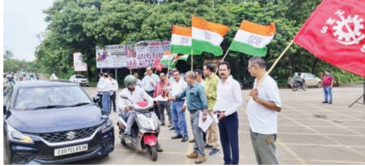
Leaders of various trade unions at Boria Gate.

Labour leaders distributed pamphlets at Boria Gate regarding labour issues.