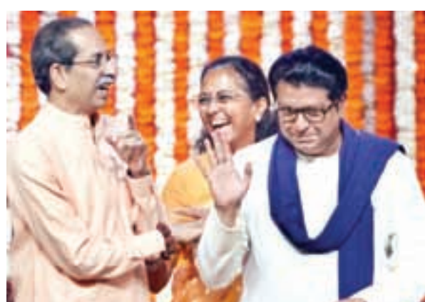
SS (UBT) chief Uddhav Thackeray and MNS chief Raj Thackeray during a joint rally.

Addressing a "victory" rally, Raj Thackeray, in a lighter vein, said Maharashtra CM Devendra Fadnis has managed to bring him and Uddhav together, a feat he said even Balasaheb Thackeray could not accomplish. After two decades,