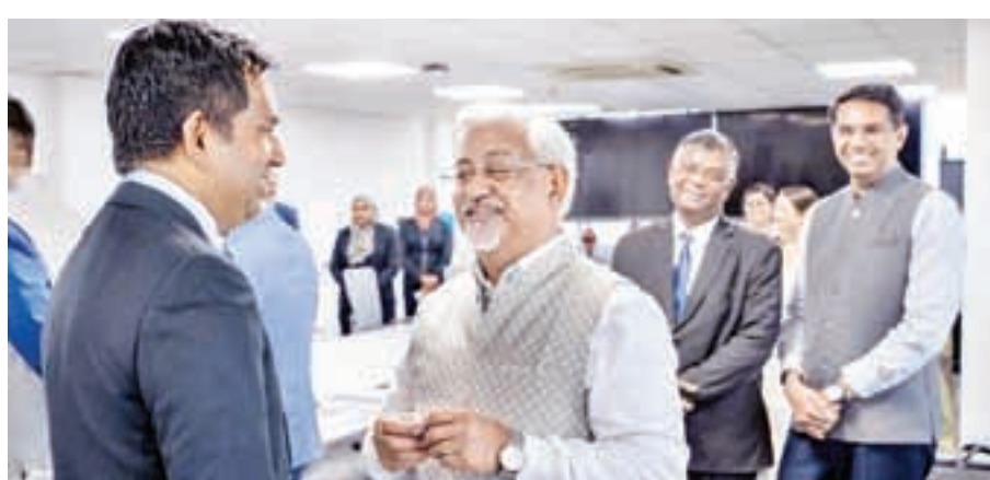
The Maldivian Minister of Trade, Mohamed Saeed is seen interacting with Indian delegation in male.

Press Trust Of India India and the Maldives discussed ways to explore new opportunities for economic cooperation and trade enhancement. MALE: India and the Maldives discussed ways to explore new opportunities for economic cooperation and trade enhancement, state-run media said on Saturday. The discussion for strengthening trade was held during a meeting between India's Commerce Secretary Sunil Barthwal and Maldivian Economic Development and Trade Minister Mohamed Saeed here. The meeting, held at the Maldivian Economic Ministry as part of Barthwal's visit, focused on