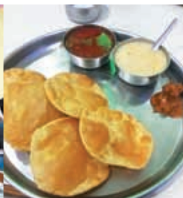
Classic Bhandare-style meal, it continues to draw visitors from far and wide.