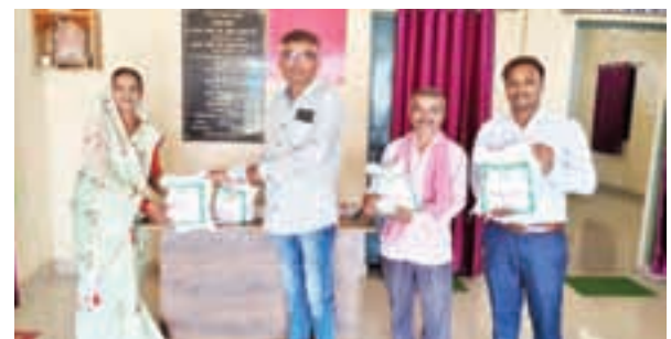
Seeds being distributed.